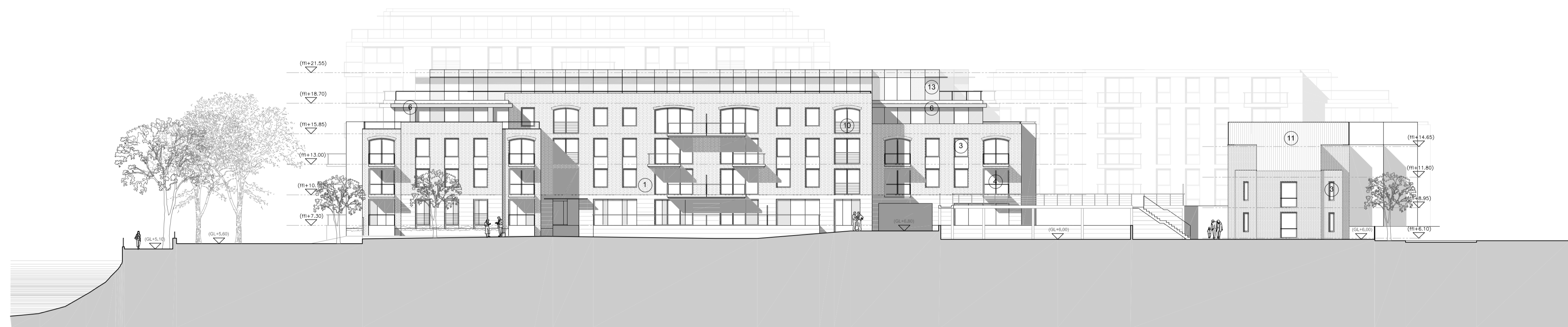
Proposed Elevation 4-4'