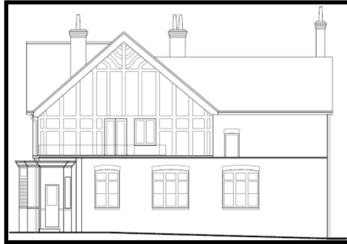
Above: Existing east elevation