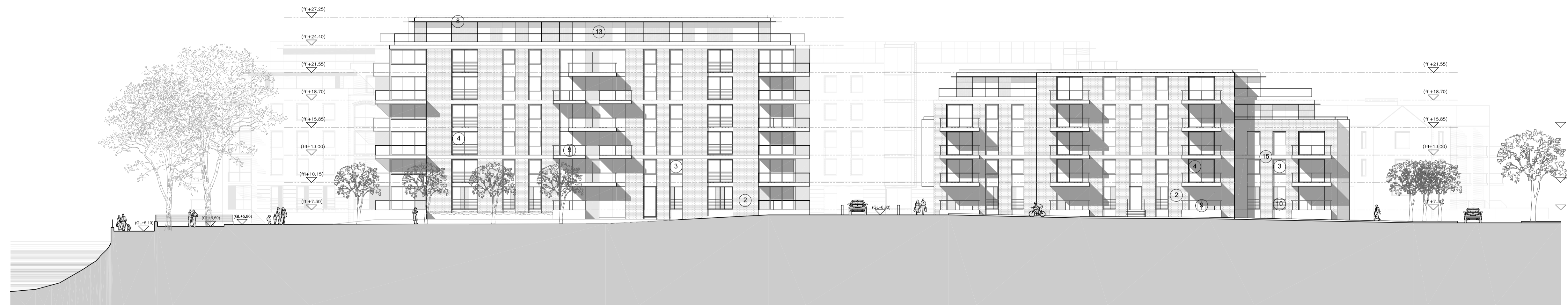
Proposed Elevation 6-6'