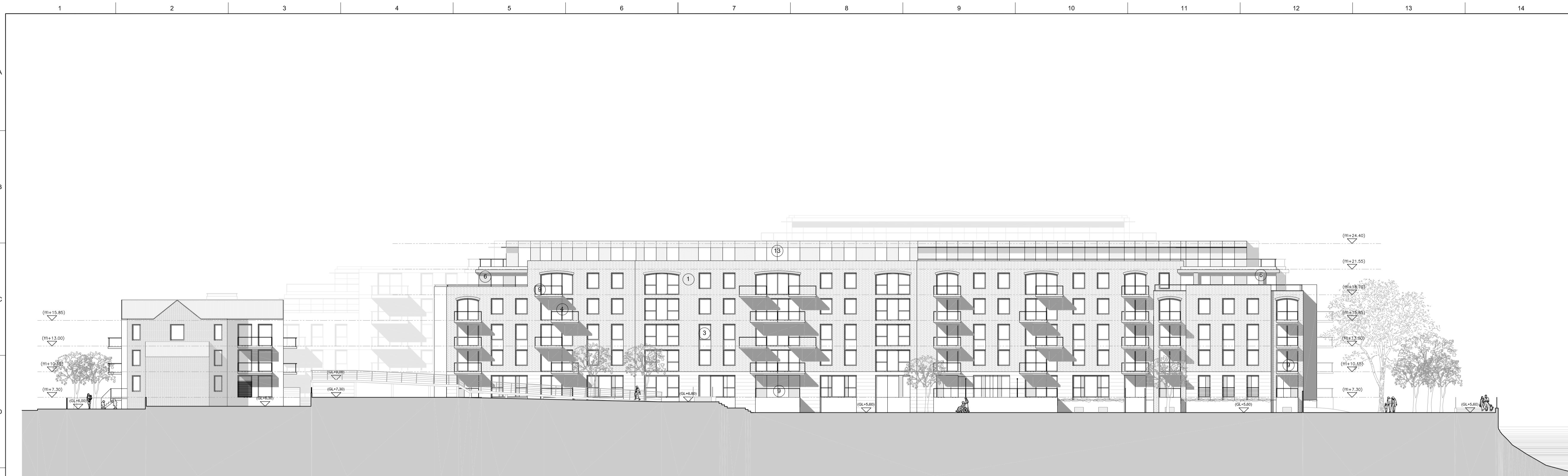
Proposed Elevation 7-7'