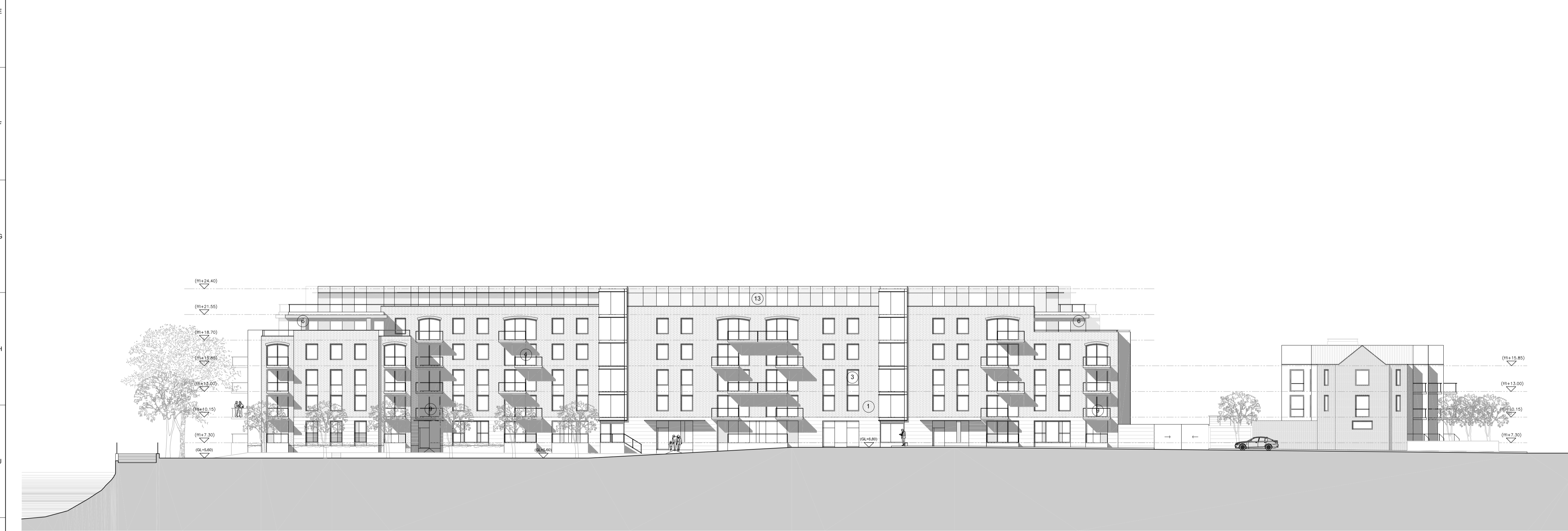
Proposed Elevation 8-8'

CLIENT STRUCTURAL ENGINEER SERVICES ENGINEER CONSULTANT