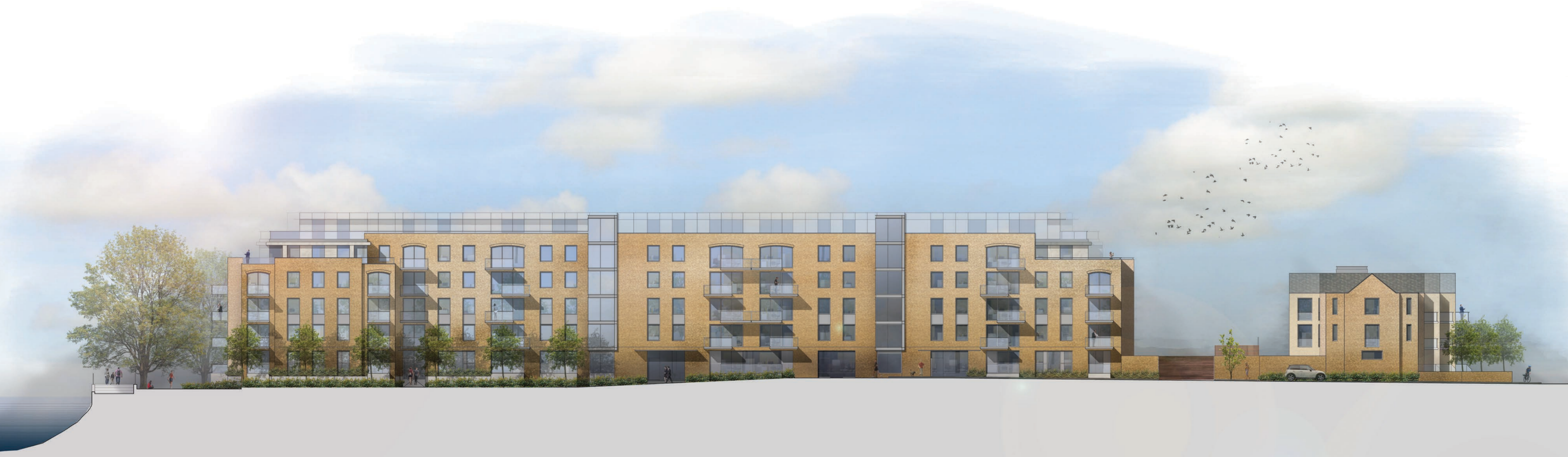
Proposed Elevation 8-8'

CLIENT STRUCTURAL ENGINEER SERVICES ENGINEER CONSULTANT