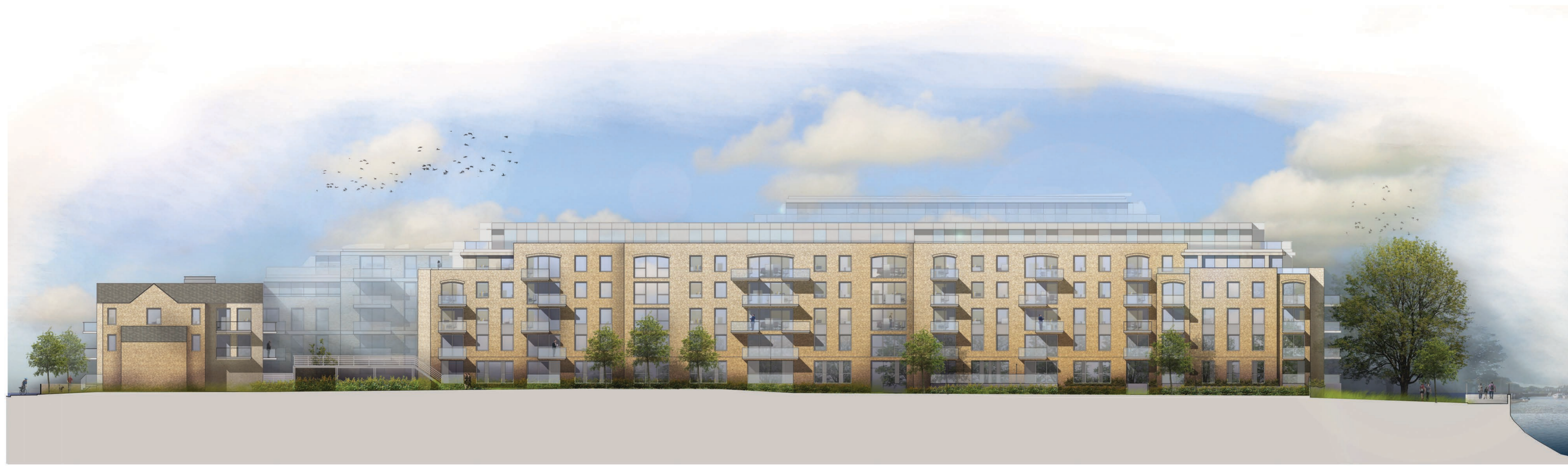
Proposed Elevation 7-7'