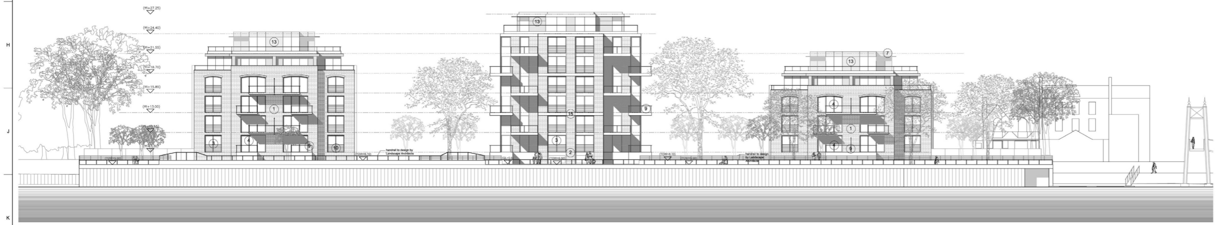
Proposed Elevation 2-2'

CLIENT STRUCTURAL ENGINEER SERVICES ENGINEER CONSULTANT