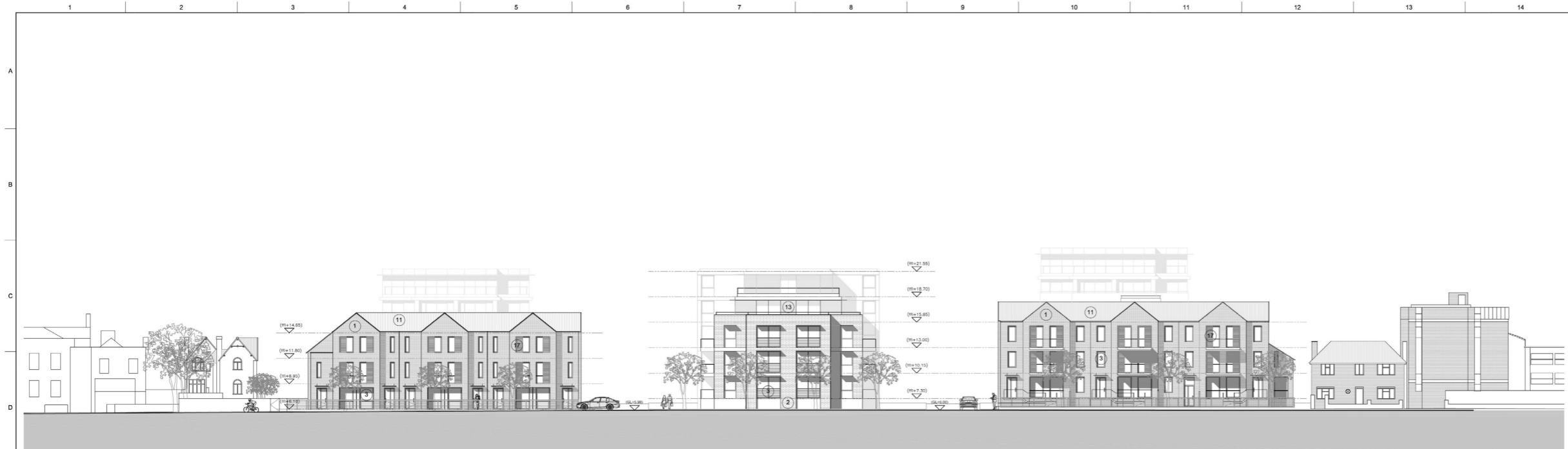
Proposed Elevation 1-1'