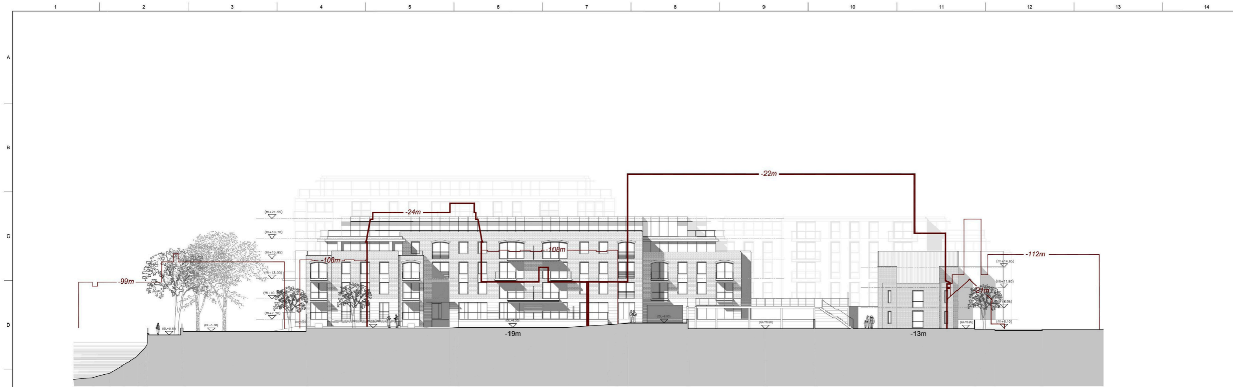
Elevation 3-3' (figured dimensions are the distance an existing or proposed plane is away from its relevant boundary)