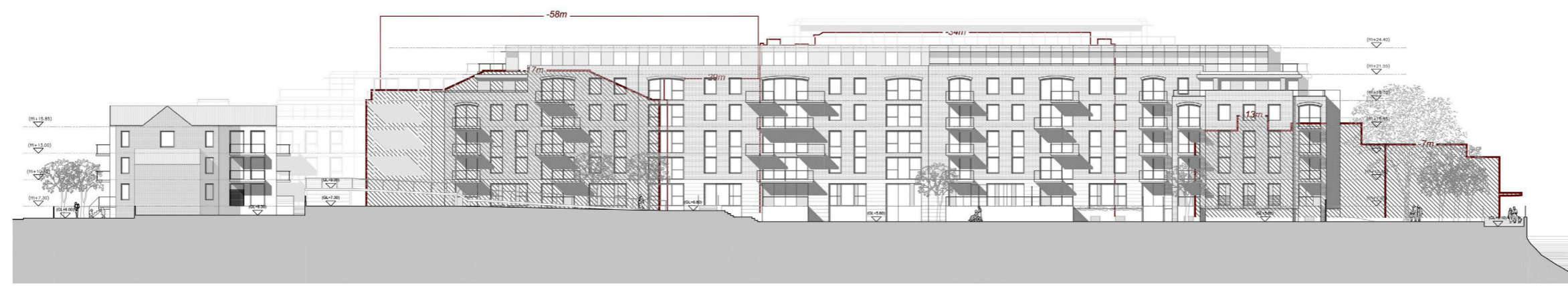
Elevation 4-4' (figured dimensions are the distance an existing or proposed plane is away from its relevant boundary)

CLIENT STRUCTURAL ENGINEER SERVICES ENGINEER CONSULTANT