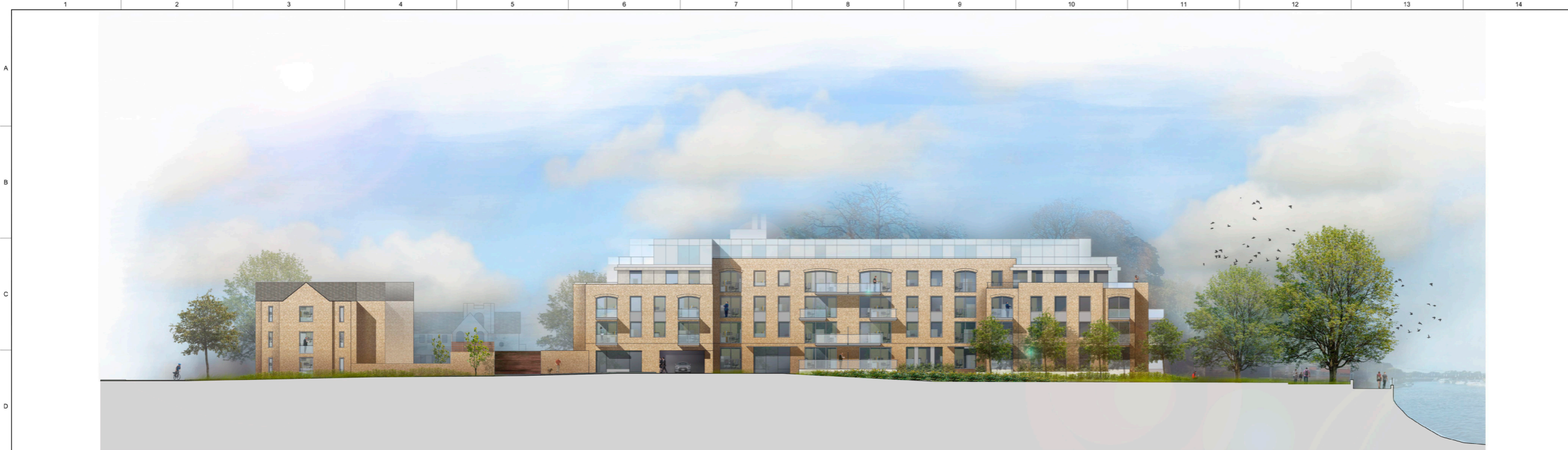
Proposed Elevation 3-3'