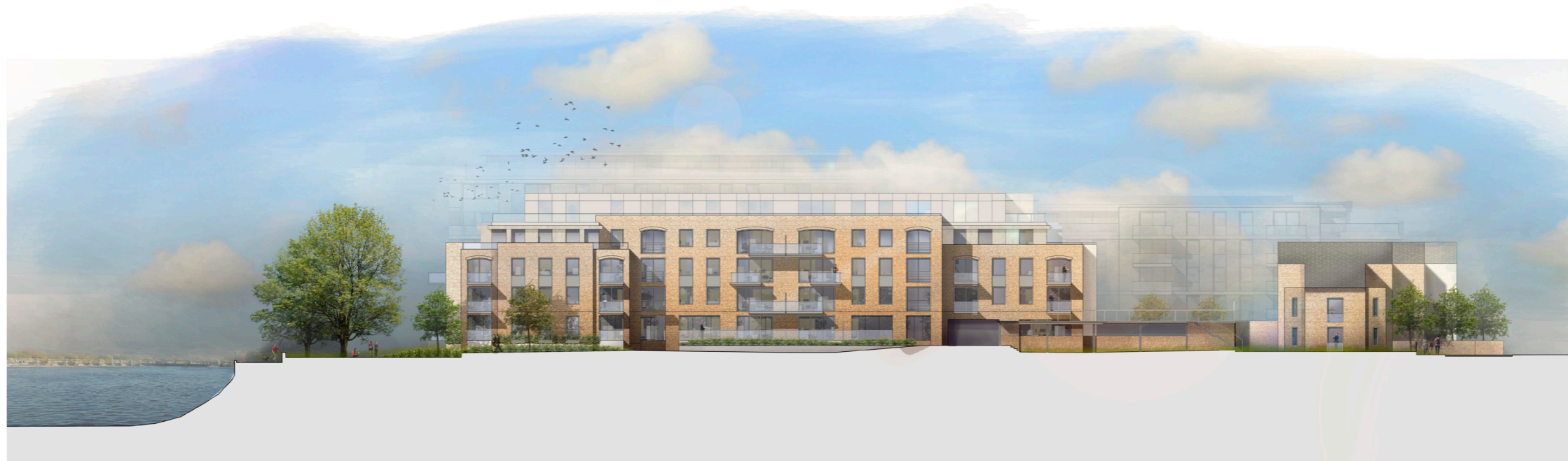
Proposed Elevation 4-4'

CLIENT STRUCTURAL ENGINEER SERVICES ENGINEER CONSULTANT