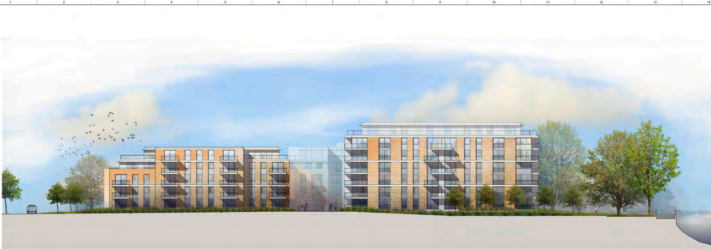
Proposed Elevation 5-5'