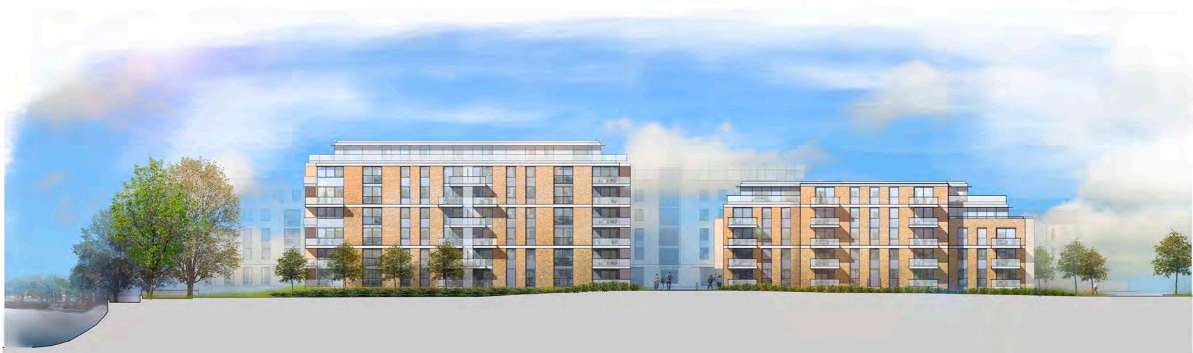
Proposed Elevation 6-6'