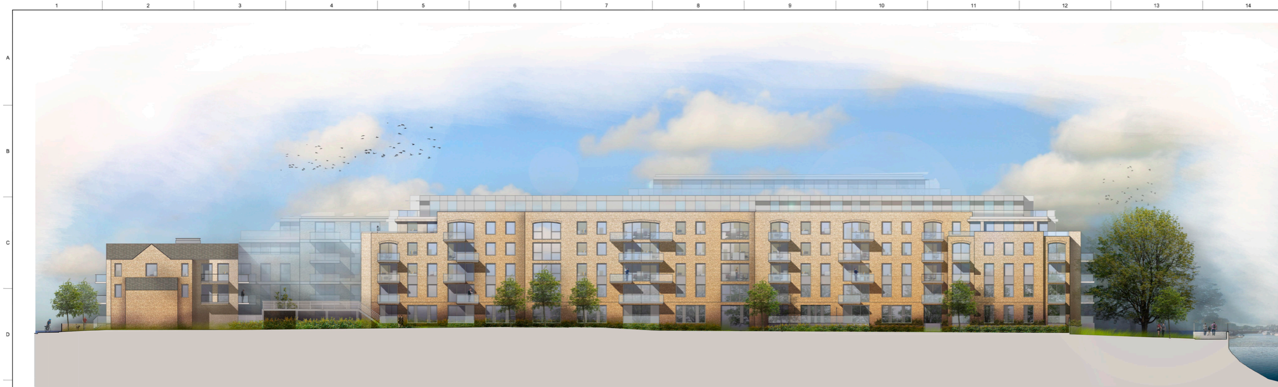
Proposed Elevation 7-7'