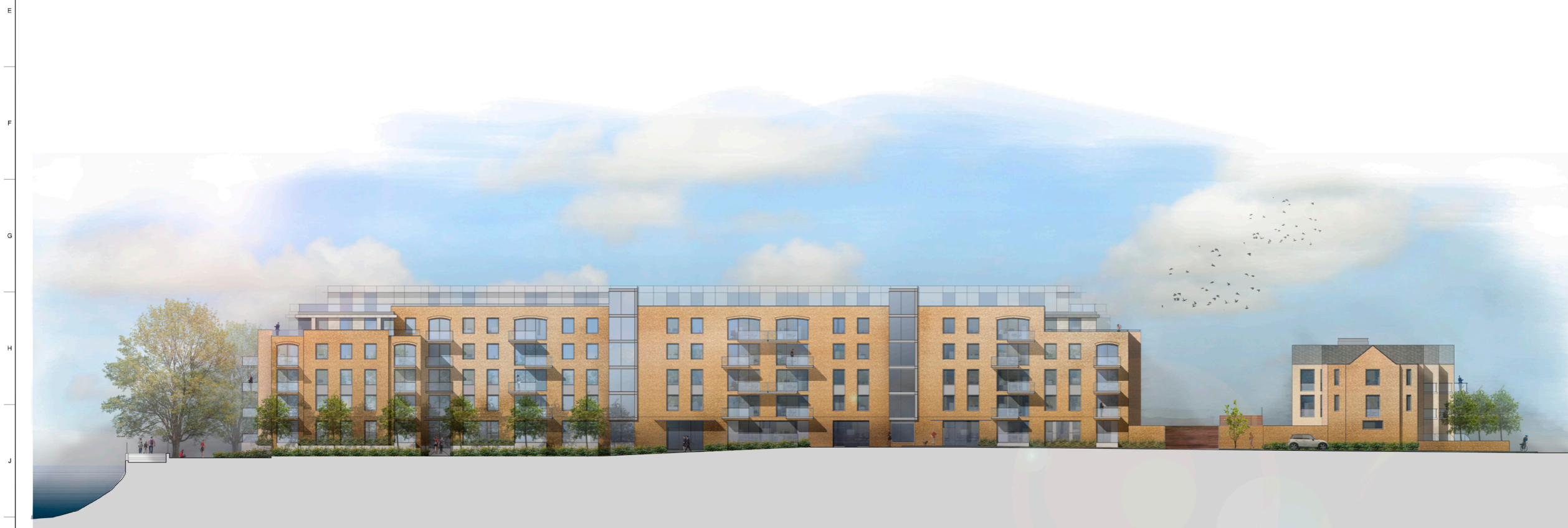
Proposed Elevation 8-8'

CLIENT STRUCTURAL ENGINEER SERVICES ENGINEER CONSULTANT