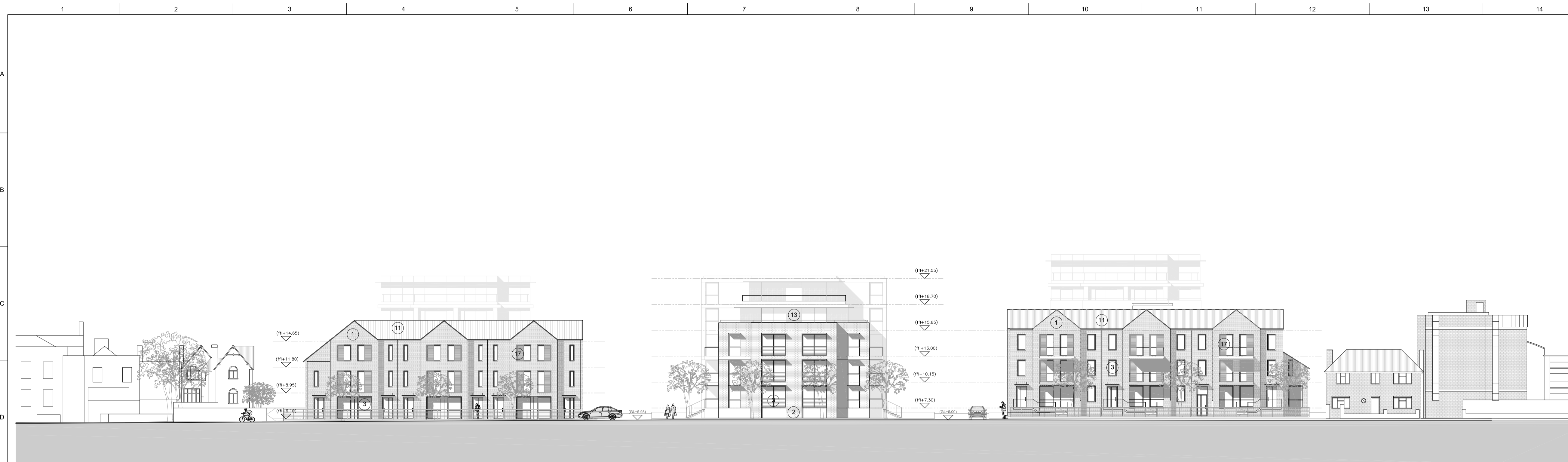
Proposed Elevation 1-1'