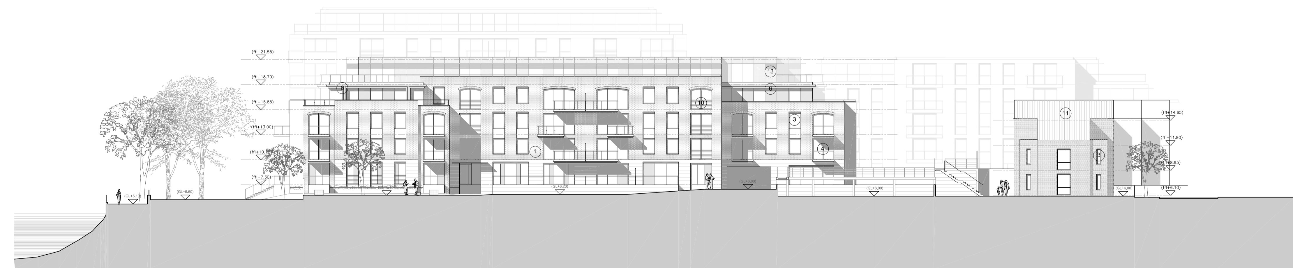
Proposed Elevation 4-4'