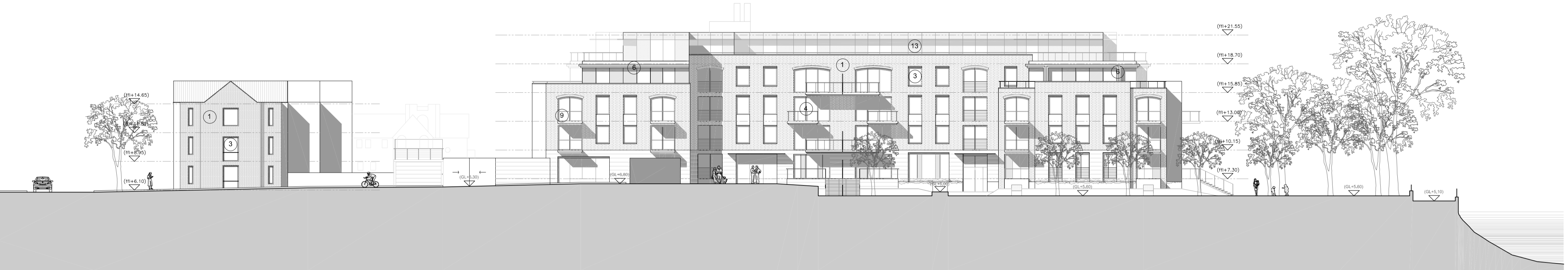
Proposed Elevation 3-3'