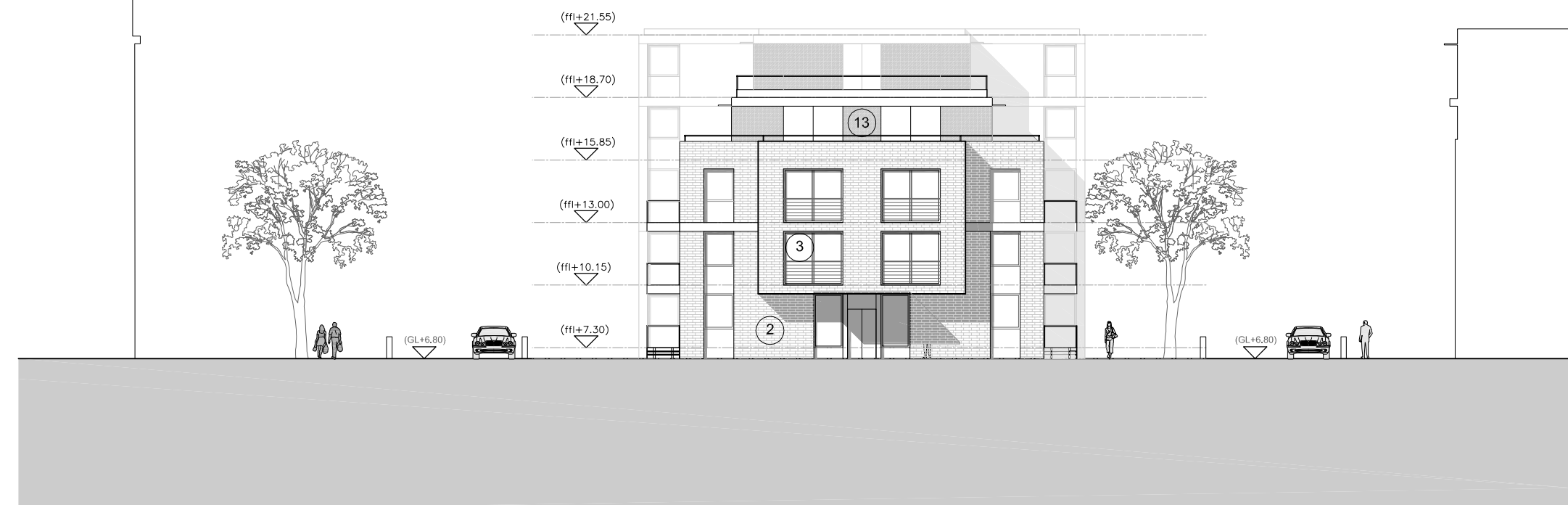
Proposed Elevation 11-11'