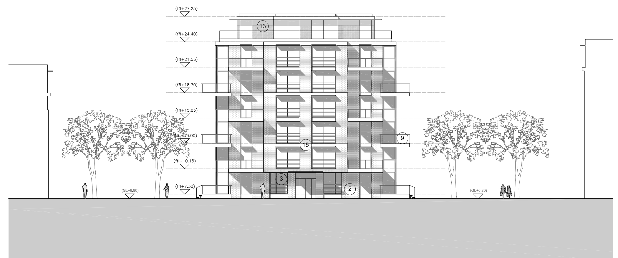
Proposed Elevation 10-10'