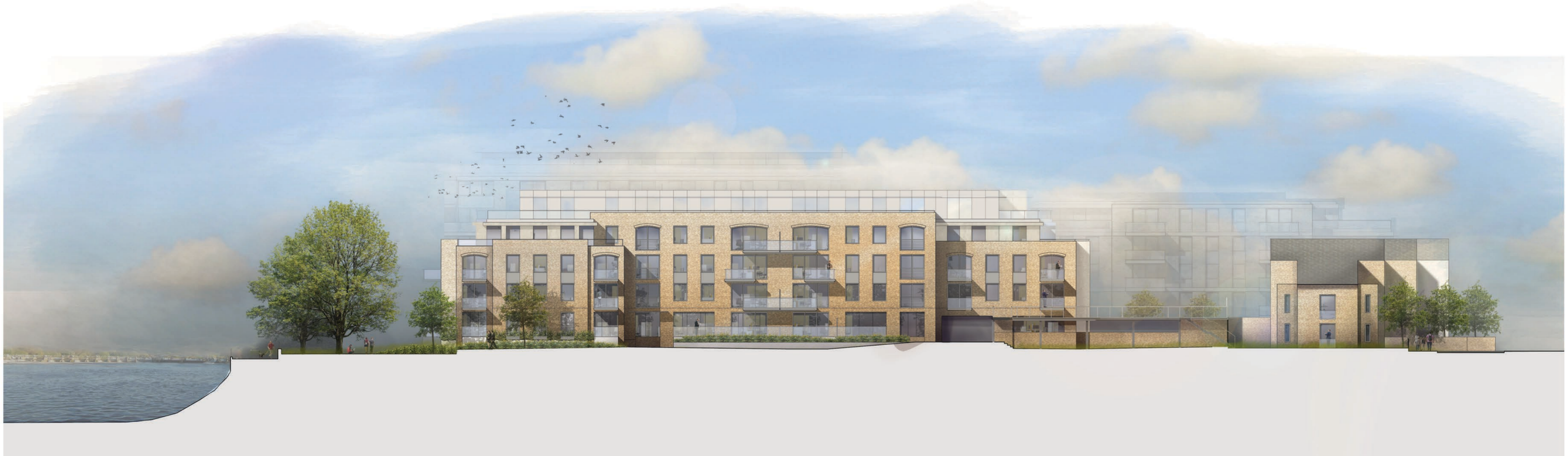
Proposed Elevation 4-4'

CLIENT STRUCTURAL ENGINEER SERVICES ENGINEER CONSULTANT