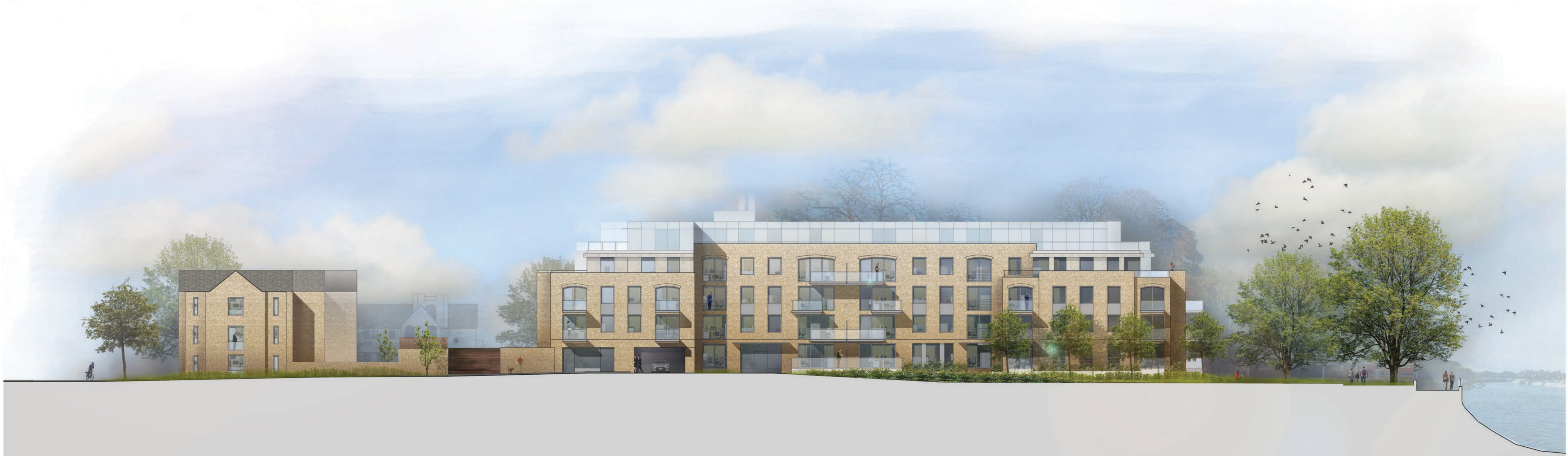
Proposed Elevation 3-3'