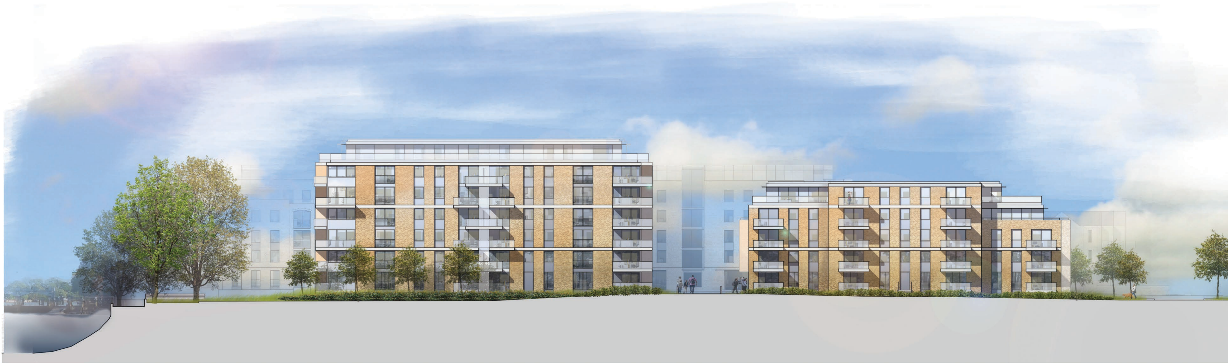
Proposed Elevation 6-6'