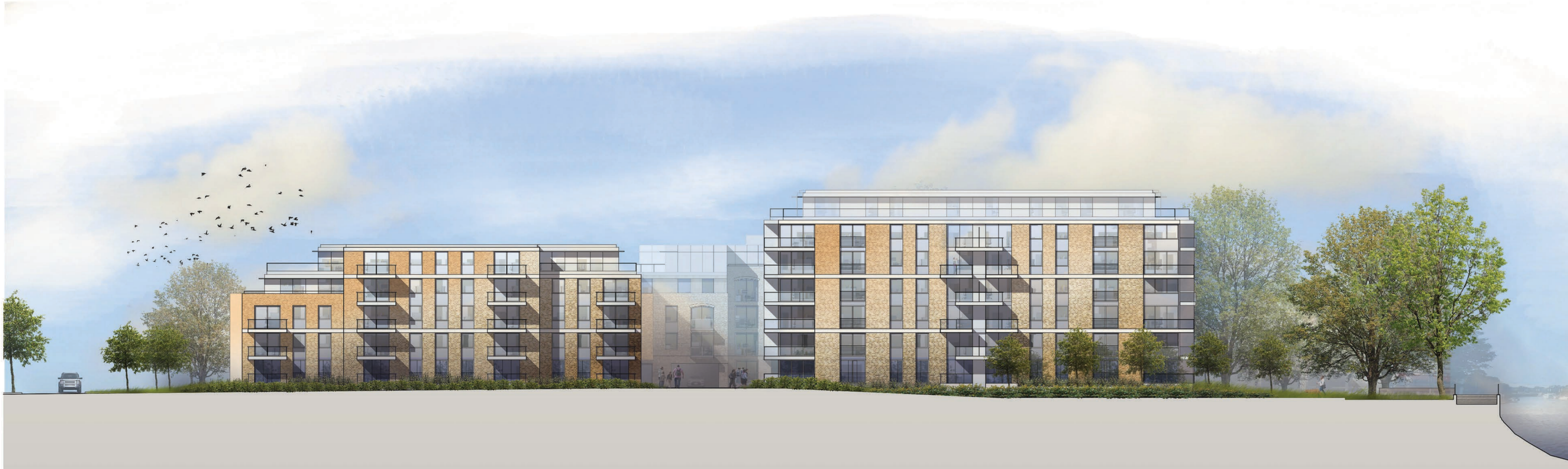
Proposed Elevation 5-5'