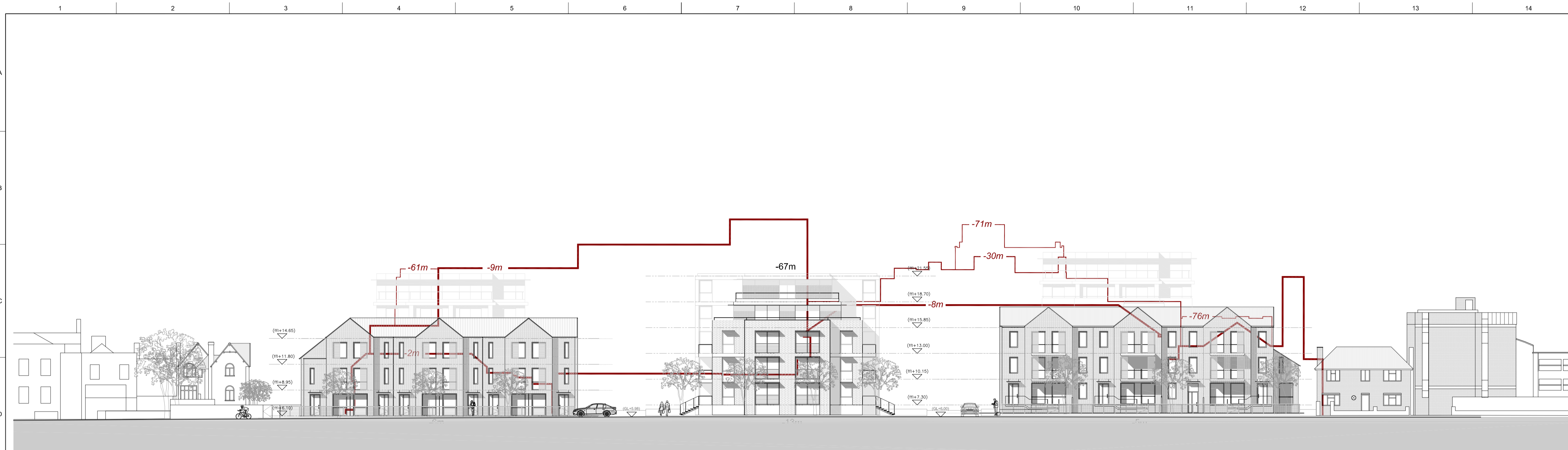
Elevation 1-1' (figured dimensions are the distance an existing or proposed plane is away from its relevant boundary)