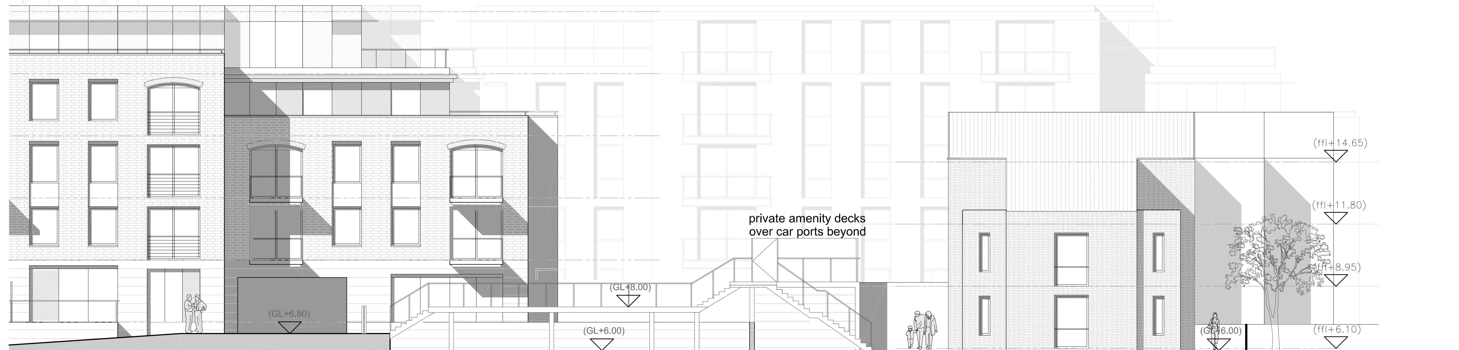
Proposed Elevation 4-4' _detail 1:100

CLIENT STRUCTURAL ENGINEER SERVICES ENGINEER CONSULTANT