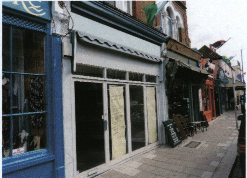
Existing view of 75 Teddington High Street

Established family run estate agent, Riverhomes Ltd, wish to have a presence in Teddington and require the existing A1 class to be changed to A2 to enable the running of an estate agent office employing six members of staff.