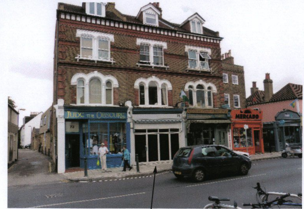
EXISTING FRONT VIEW OF 75 TEDDINGTON HIGH STREET