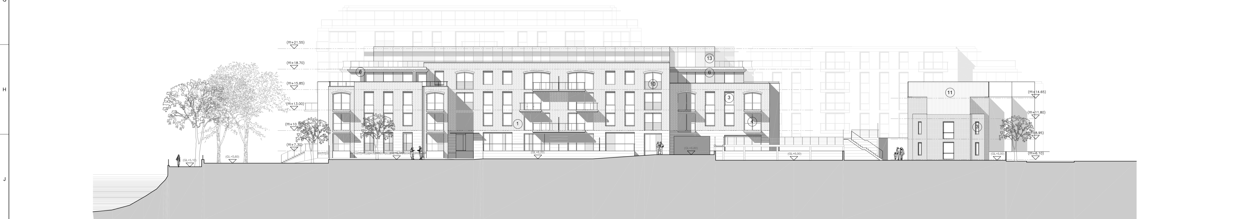
Proposed Elevation 4-4'

CLIENT STRUCTURAL ENGINEER SERVICES ENGINEER CONSULTANT