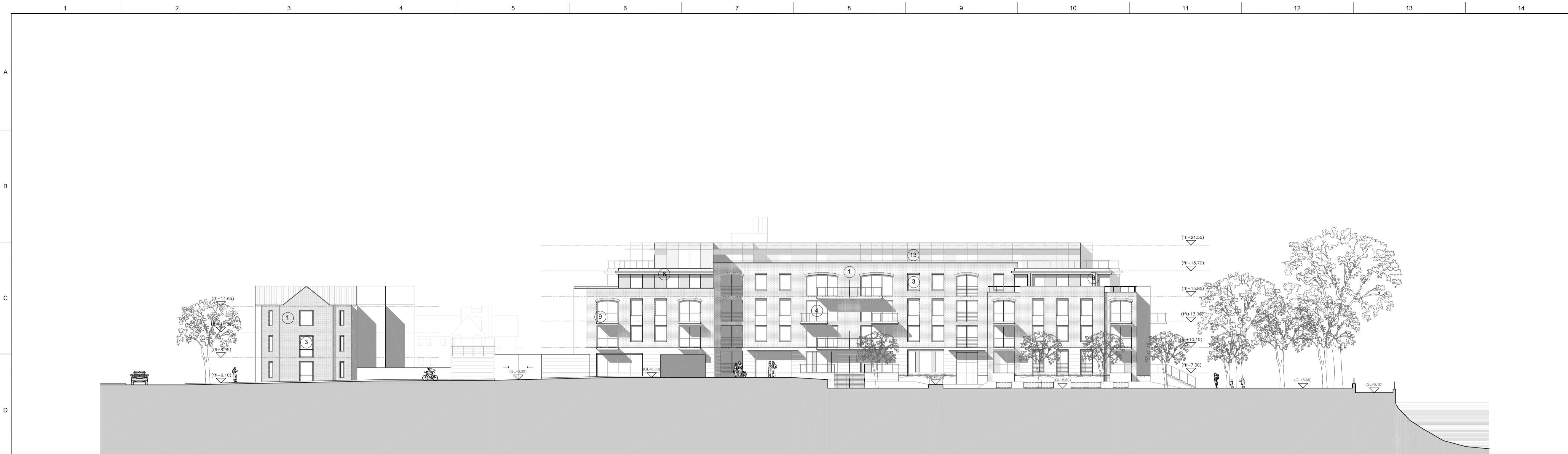
Proposed Elevation 3-3'