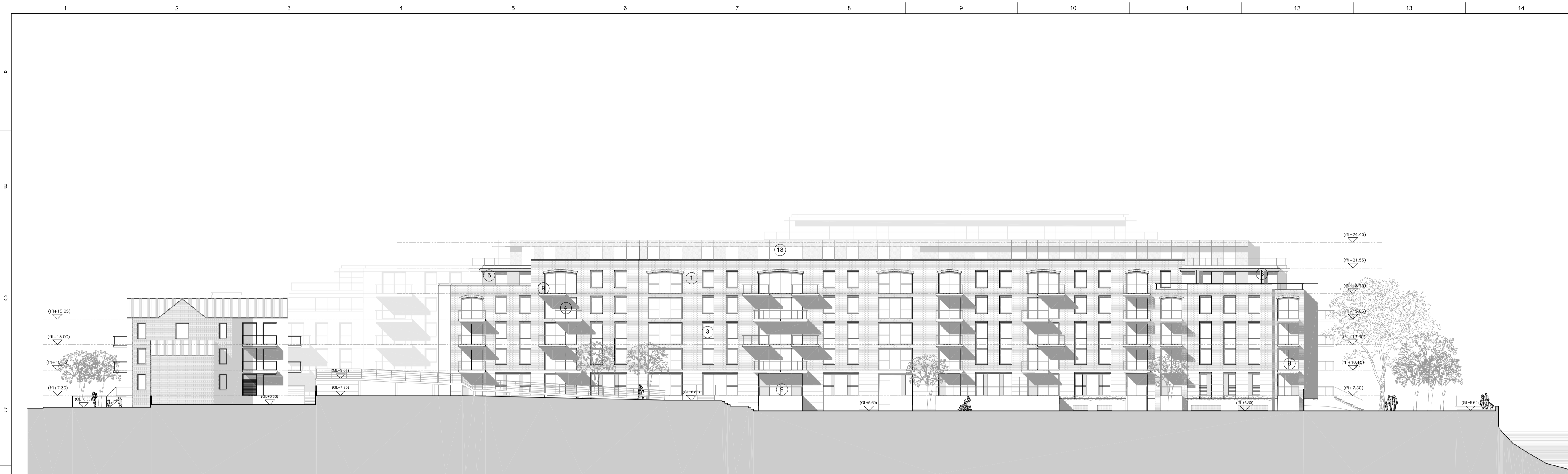
Proposed Elevation 7-7'