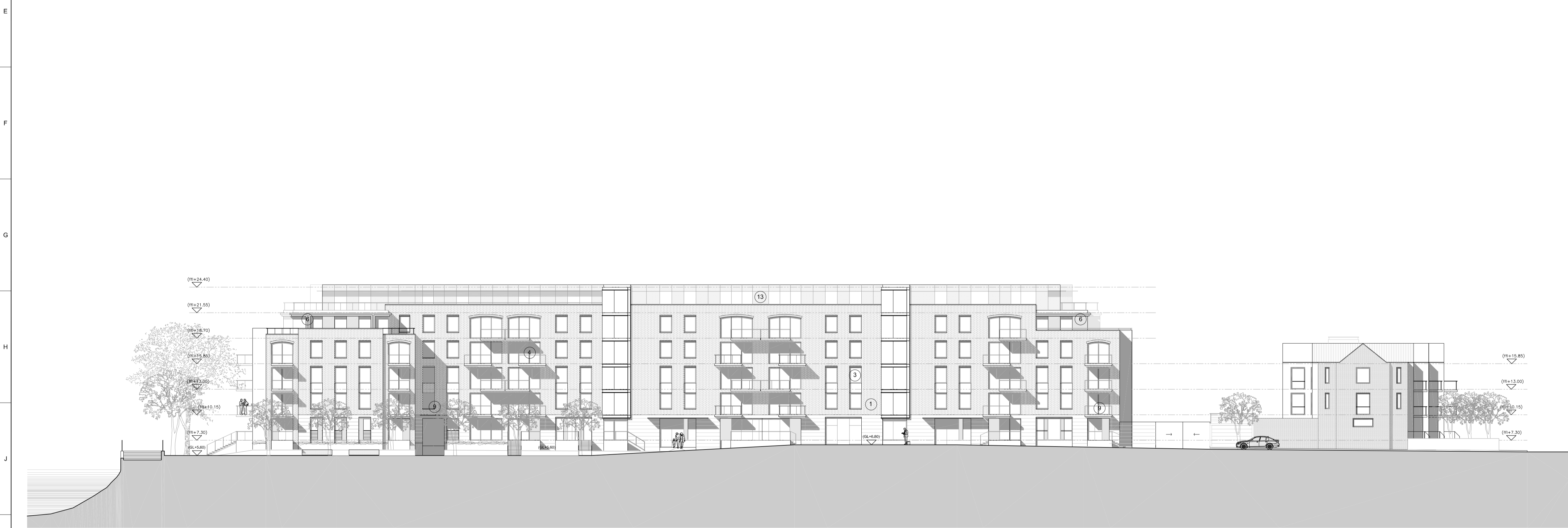
Proposed Elevation 8-8'

CLIENT STRUCTURAL ENGINEER SERVICES ENGINEER CONSULTANT