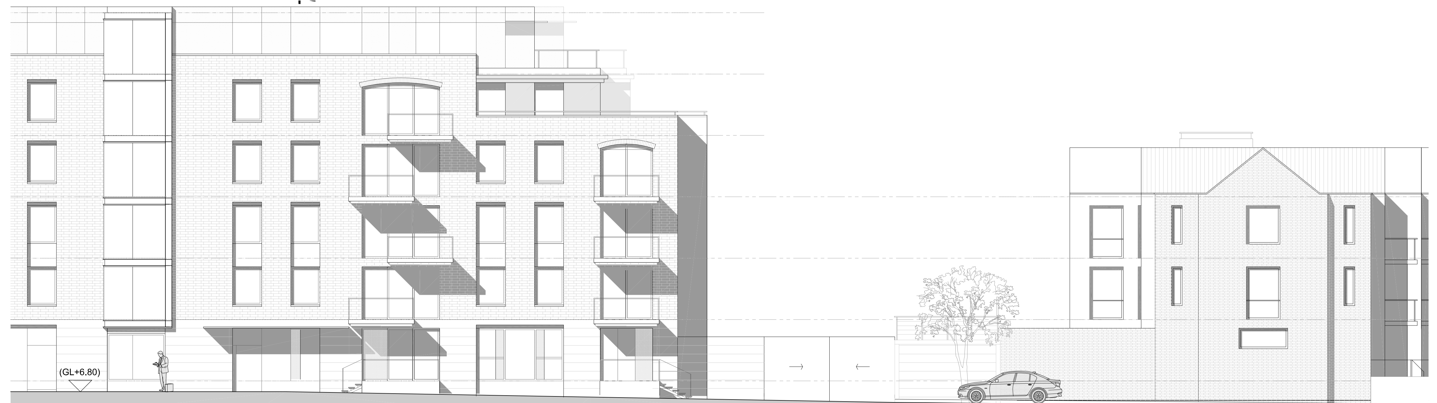
Proposed Elevation 8-8' detail 1:100