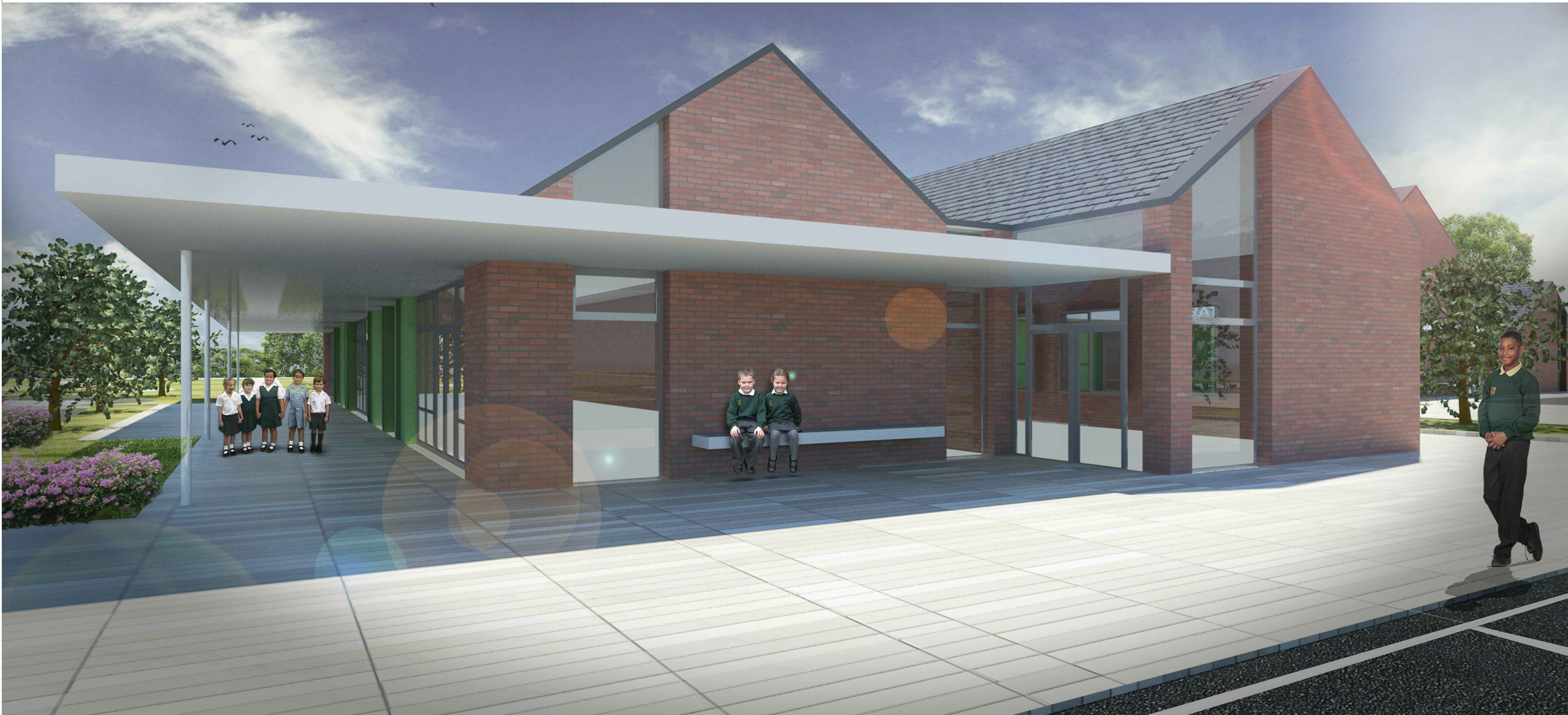
View of Main Entrance of Strathmore SEN School