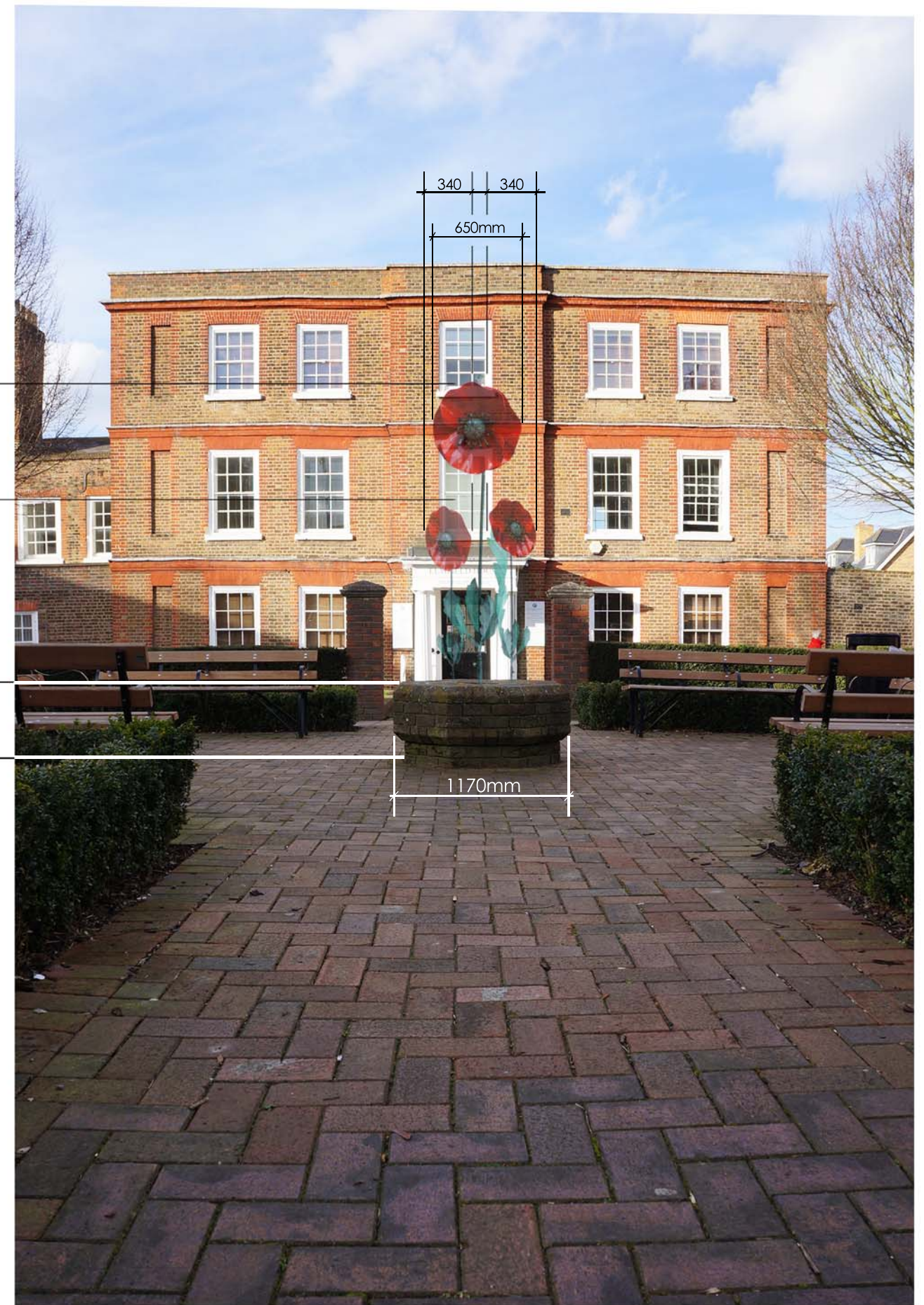
Proposed Elevation towards Elmfield House