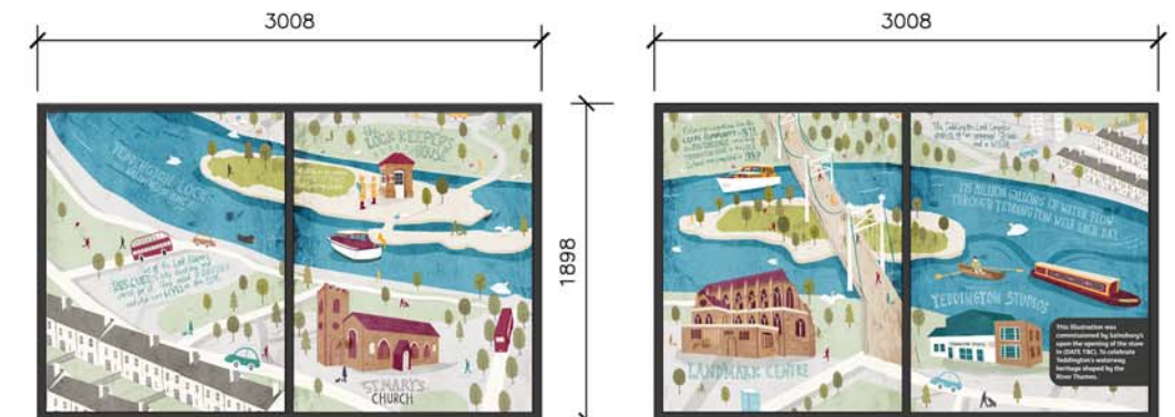
03 PROPOSED VINYL- SIDE ELEVATION P 24 52212 1:50- DIMENSIONS TO BE CHECKED ON SITE

Signage contractor to confirm material of the offer panel & check bespoke text size.