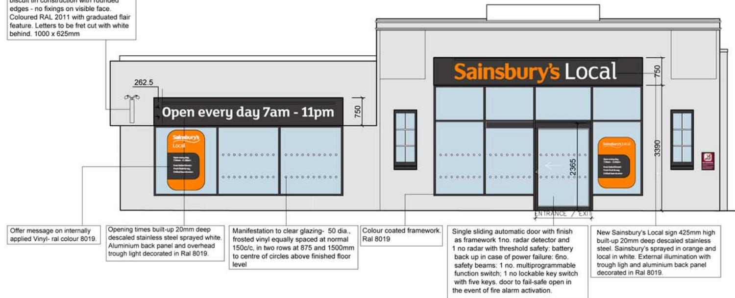
02 PROPOSED FRONT ELEVATION P 24 52212 1:50

Double sided externally illuminated aluminium projecting sign. Formed as a biscuit tin construction with rounded edges - no fixings on visible face. Coloured RAL 2011 with graduated flair feature. Letters to be fret cut with white behind. 1000 x 625mm