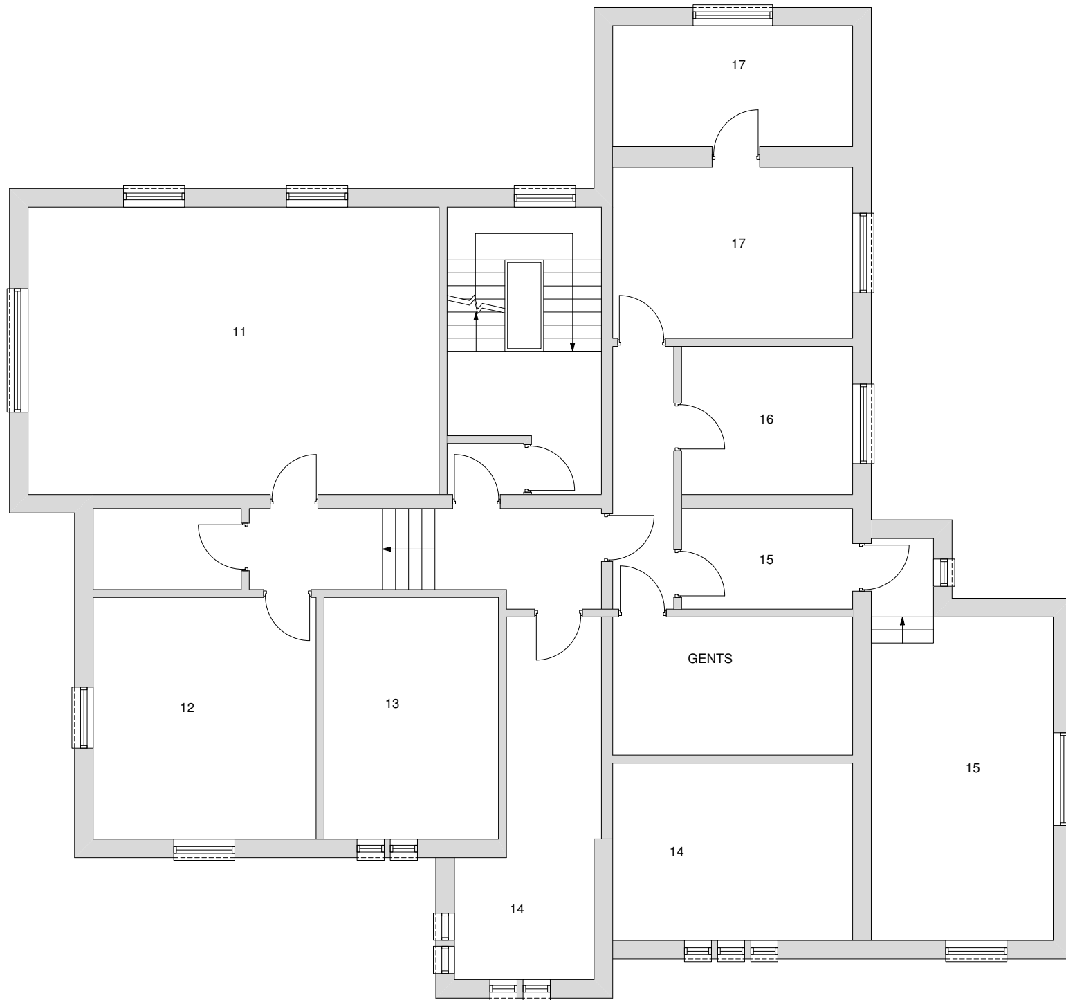
1:100 FIRST FLOOR PLAN