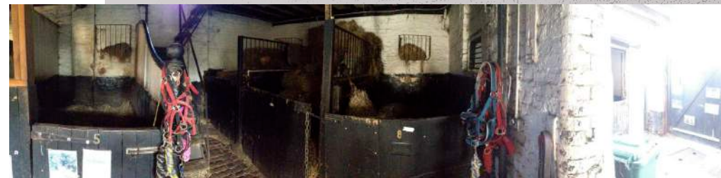
Photo 1: General view of interior and stables, with redundant stable at back, steep steps up to tack room, and front courtyard out to the right