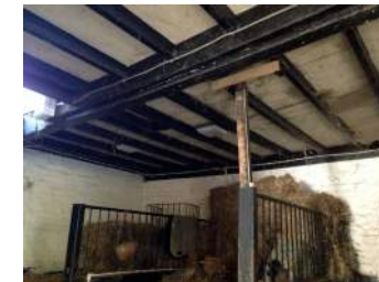
Photo 4: Temporary structure to provide support to deteriorating roof structure