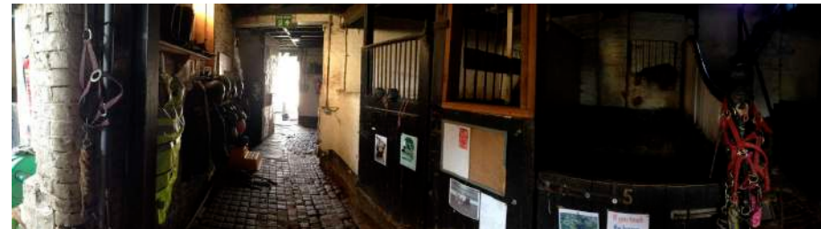
Photo 2: General view of interior and stables, with racks on left for riding hats and bridles, and reception counter beyond