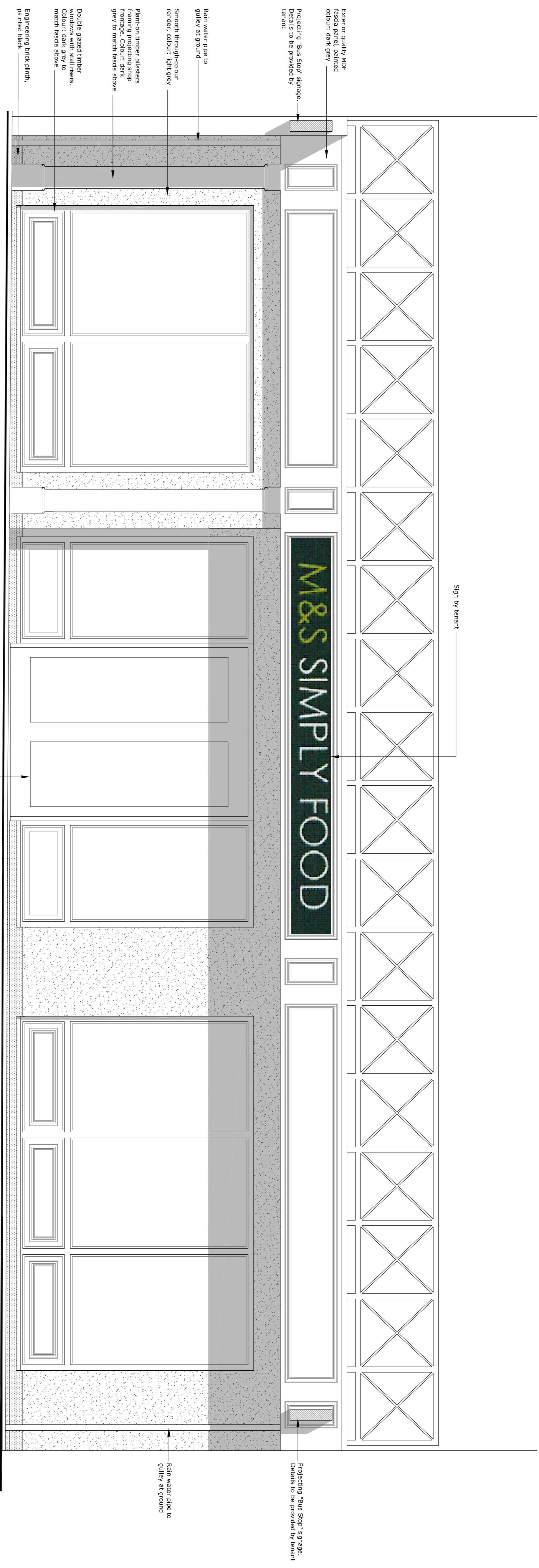
1 Shop Front Elevation Scale 1:25