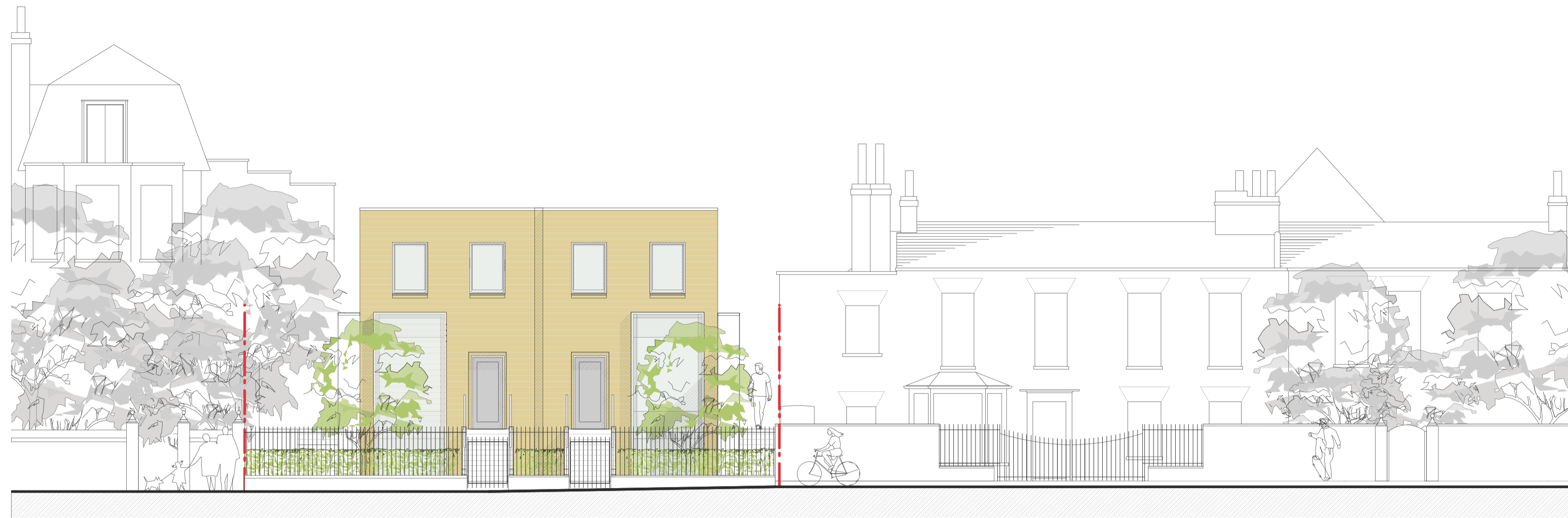
THAMES STREET SOUTH ELEVATION 1:100