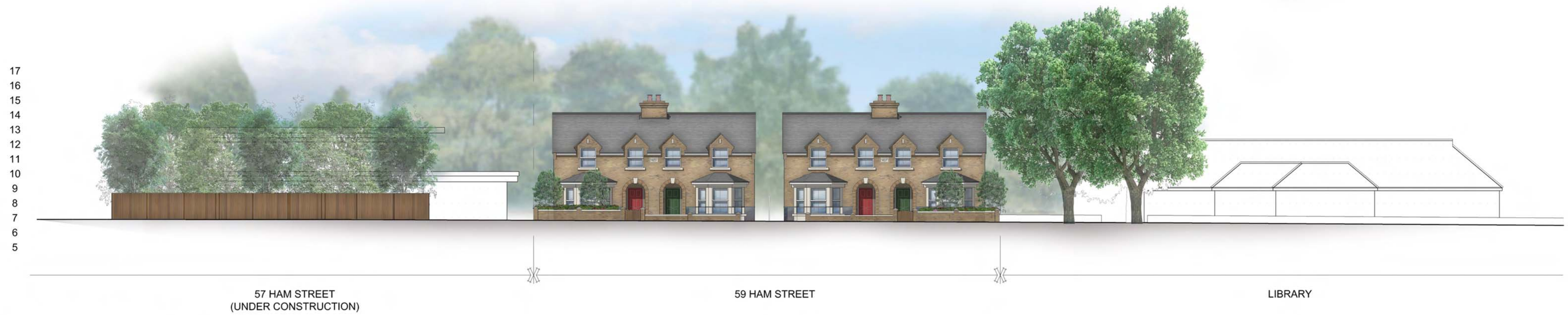
PROPOSED STREET SCENE (A-A)