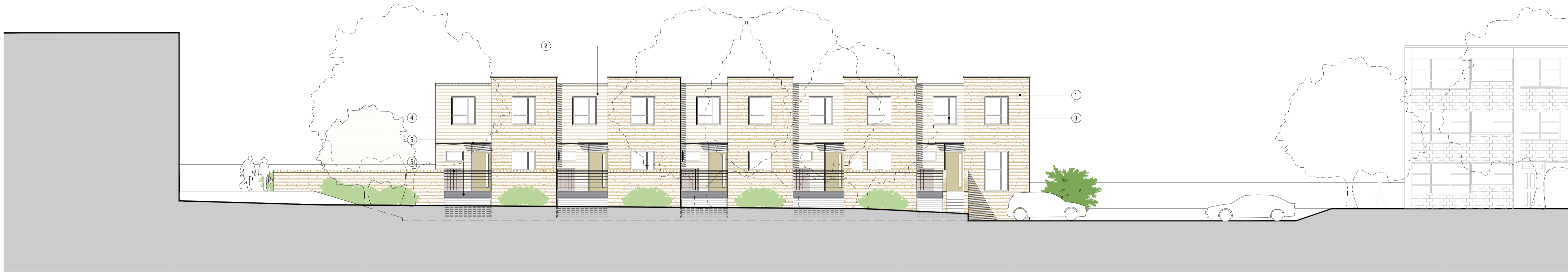
STREET SCENE (A) (1:100)