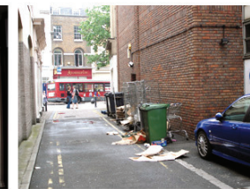
View 7 - Wellington Yard: parking and bins storage area, street lack of surveillance