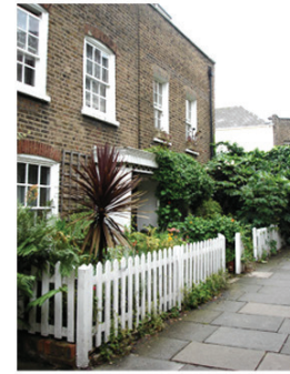
View 8 - Adjacent residential entrance and windows provide natural surveillance to the access road