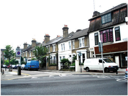
View 1 - Residential area