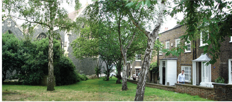
View 2 - St. Mary Magdalene's Church and church cottages