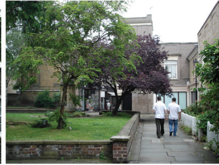
View 3 - Pedestrian path to the back of Tesco