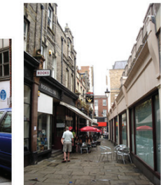
View 5 - Church Court: street too narrow for new entrance shaft extension