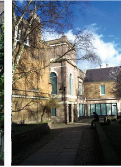
View 4 - Existing view for new entrance extension