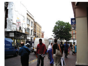
View 6 - George Street: street too busy for residential entrance