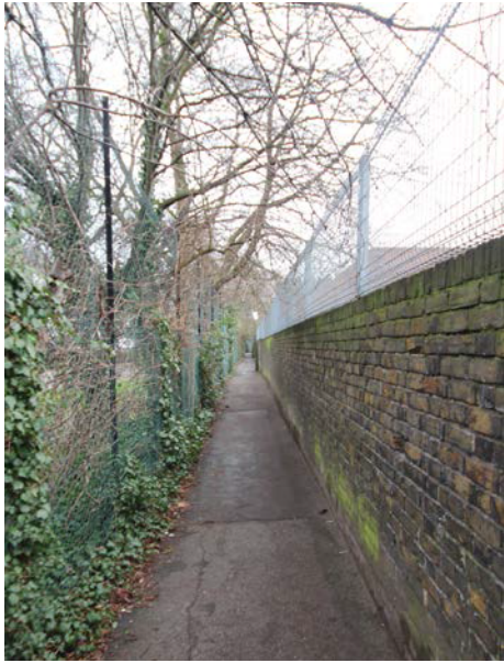
2. MARSH FARM LANE ALONG WESTERN BOUNDARY OF THE MAIN SITE.