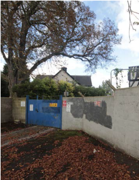
6. VIEW OF THE ENTRANCE TO THE COUNCIL DEPOT FROM THE SOUTH.