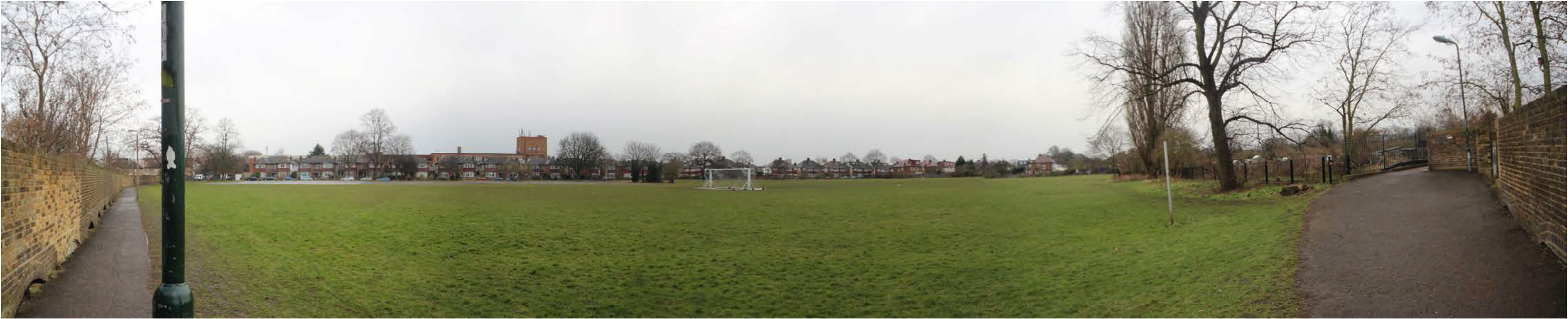
4. VIEW TOWARDS RICHMOND-UPON-THAMES COLLEGE ACROSS THE COLLEGE PLAYING FIELDS, SHOWING MARSH FARM LANE (AT EDGES).