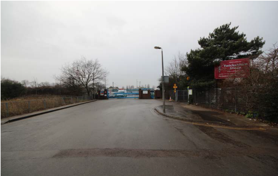
1. VIEW TOWARDS THE COUNCIL DEPOT TO THE WEST OF THE CRANEFORD WAY OPEN SPACES, SHOWING THE SOUTHERN ACCESS TO TWICKENHAM STOOP AT RIGHT.