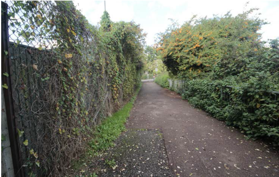
2. PUBLIC FOOTPATH ALONG EASTERN BOUNDARY OF THE COUNCIL DEPOT.