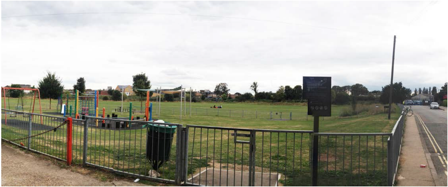
3. VIEW OF THE CRANEFORD WAY OPEN SPACE FROM THE CORNER OF CRANEFORD WAY AND MARSH FARM LANE.