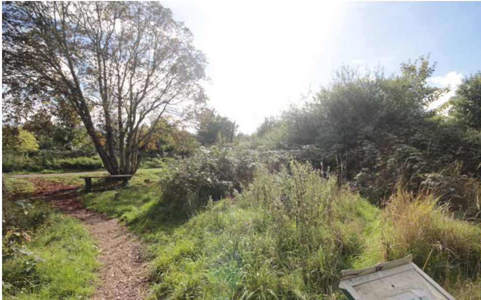
7. VIEW OF THE NATURE RESERVE TO THE SOUTH OF THE RAILROAD, SOUTH OF THE COUNCIL DEPOT.