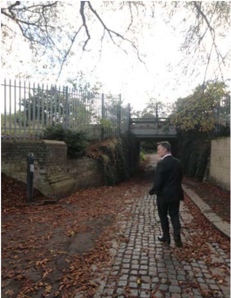
5. VIEW OF THE PASSAGE UNDER THE RAIL-LINE SOUTH OF THE COUNCIL DEPOT.