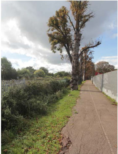
4. PUBLIC FOOTPATH ALONG SOUTHERN BOUNDARY OF THE COUNCIL DEPOT.