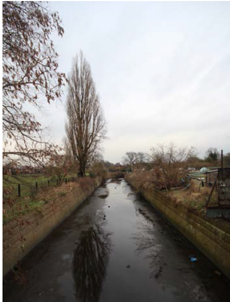
3. VIEW OF THE CANALISED RIVER CRANE SOUTH OF THE PLAYING FIELD SITE.