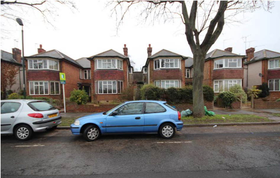
1. TYPICAL 1930s PRIVATE HOUSING ON CRANEFORD WAY.