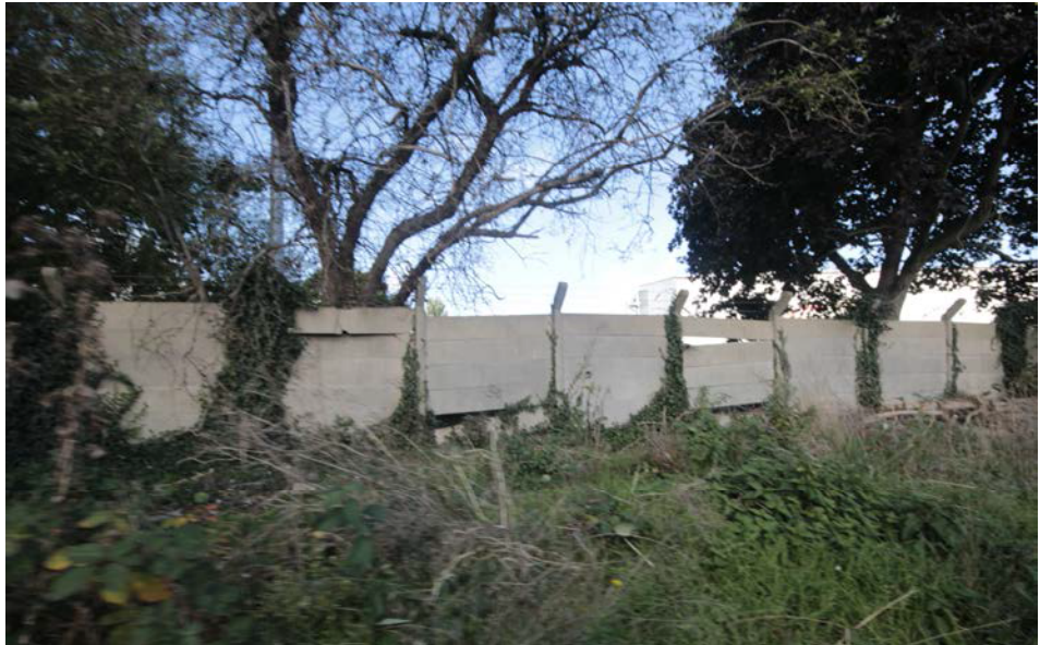
8. VIEW OF THE BOUNDARY TO THE WEST OF THE COUNCIL DEPOT, FACING THE DUKE OF NORTHUMBERLAND'S RIVER.