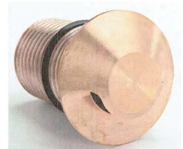
Recessed in-ground luminaire