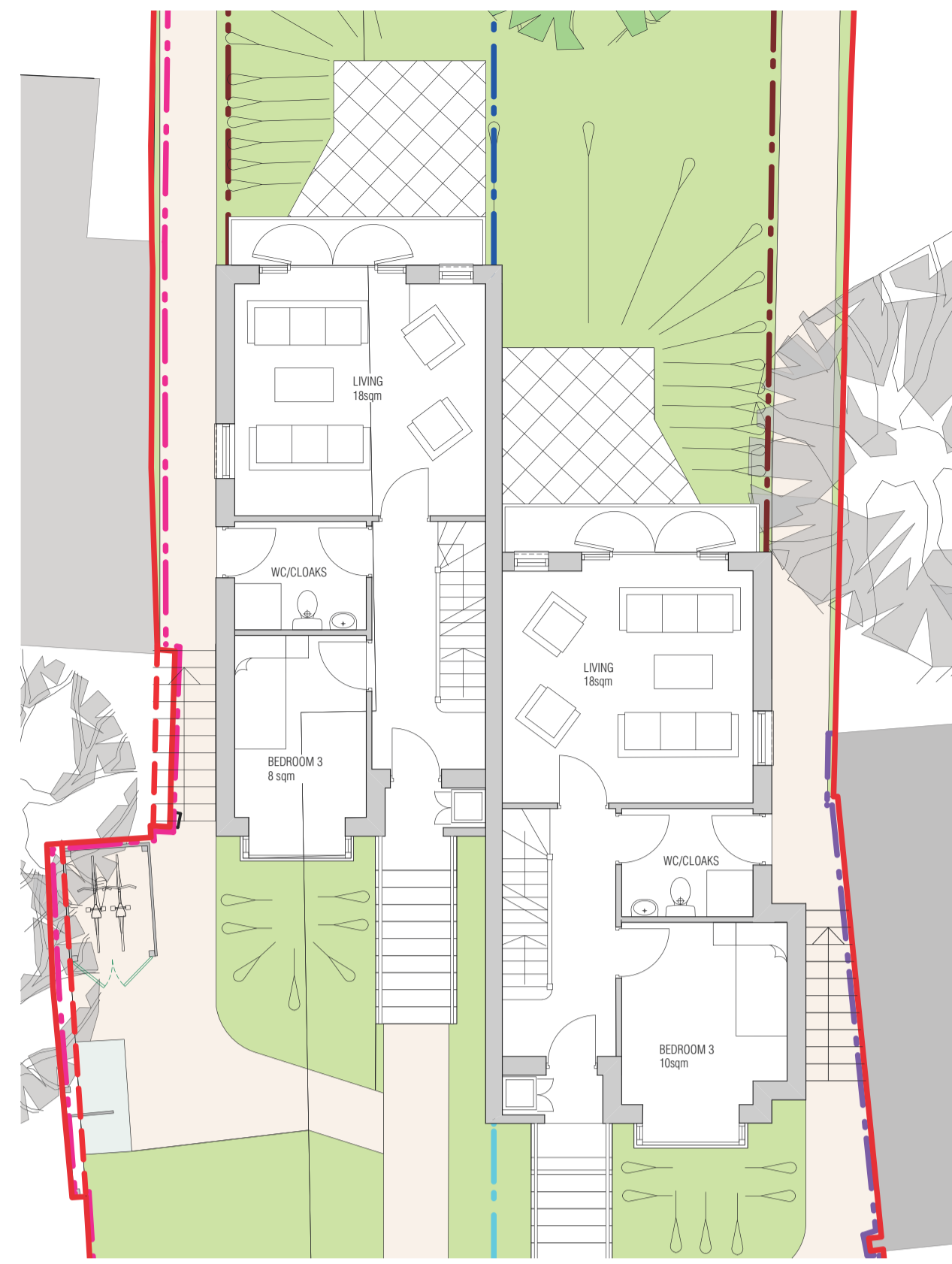
THAMES STREET HOUSES - GROUND FLOOR PLAN 1:100