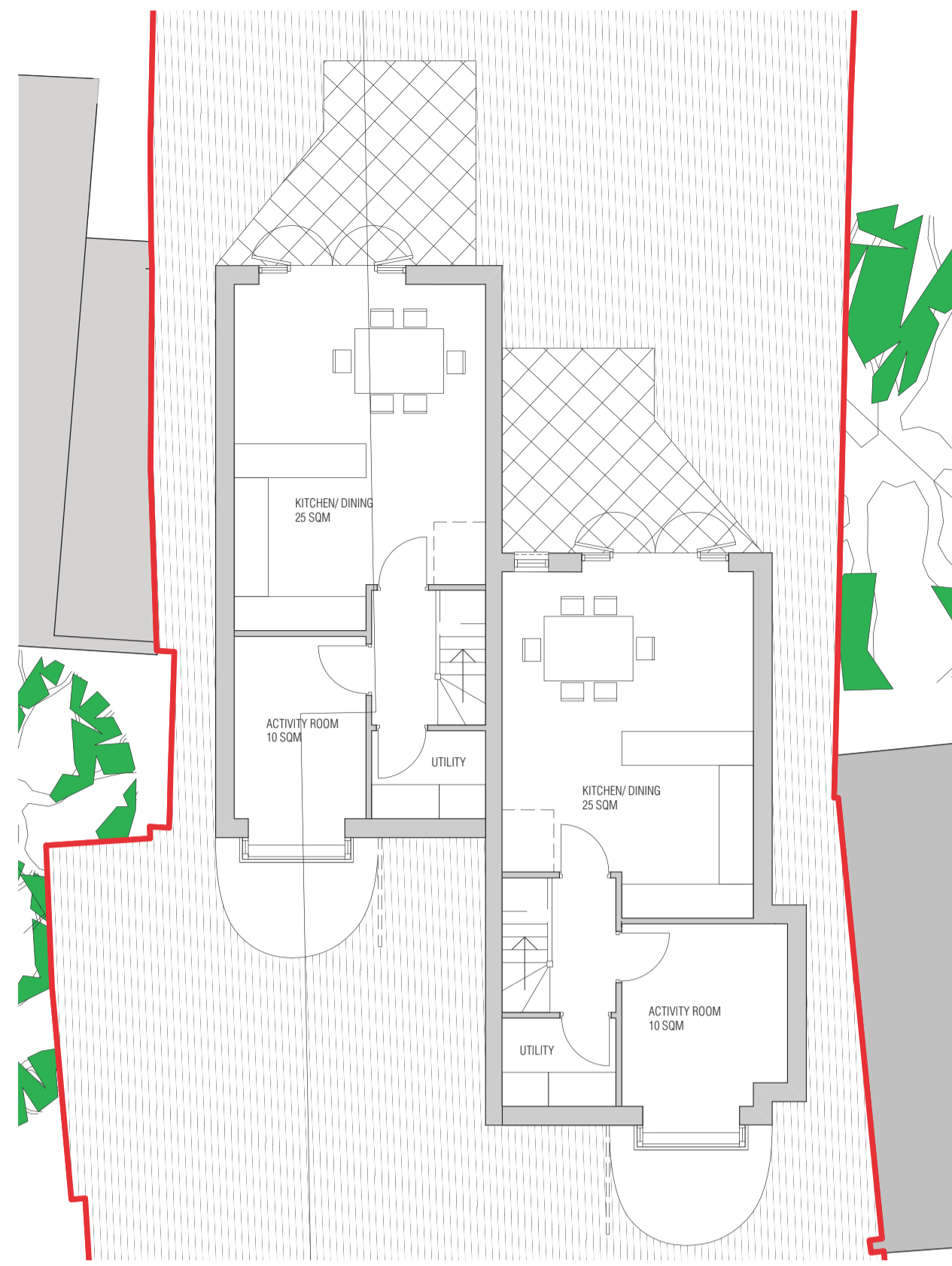
THAMES STREET HOUSES - LOWER GROUND FLOOR PLAN 1:100