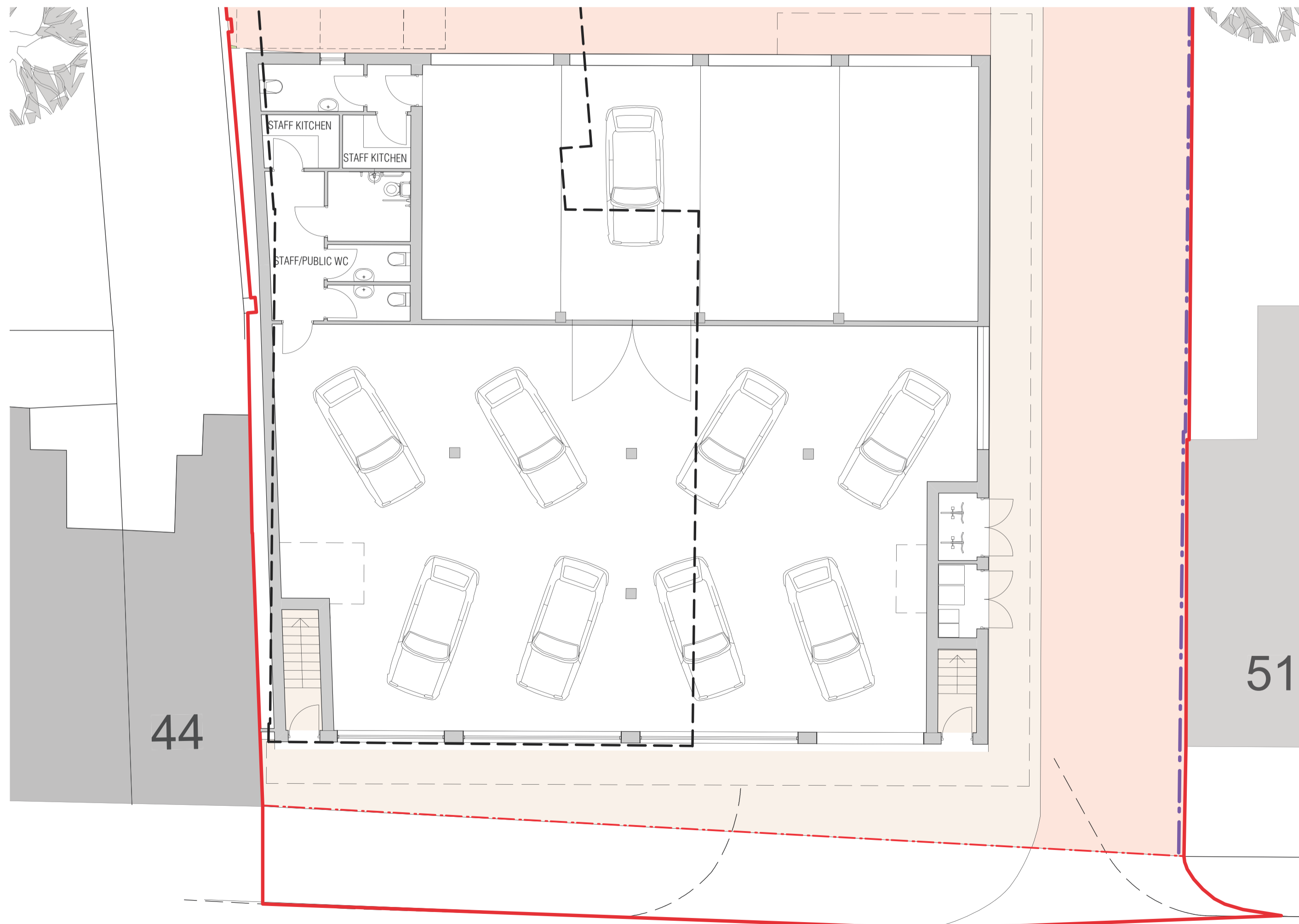
STATION ROAD - SHOWROOM AND GARAGE GROUND FLOOR PLAN 1:100