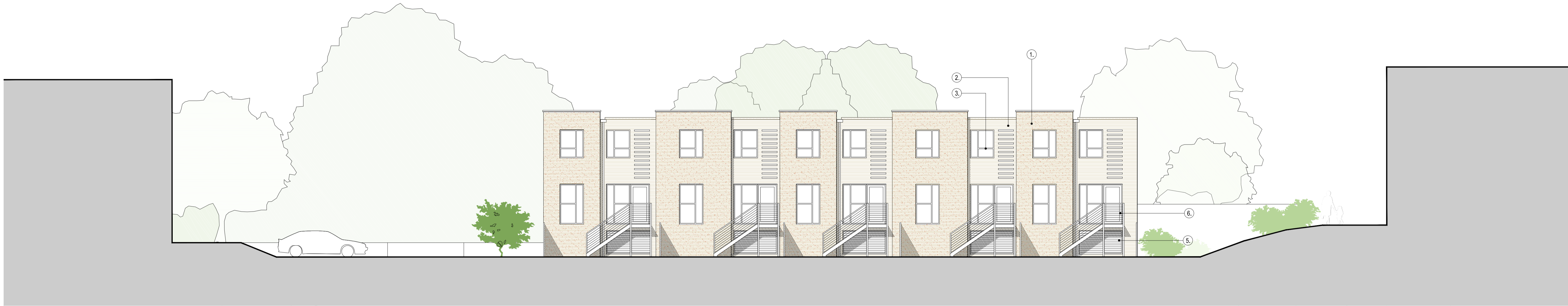
REAR ELEV (A) (1:100)