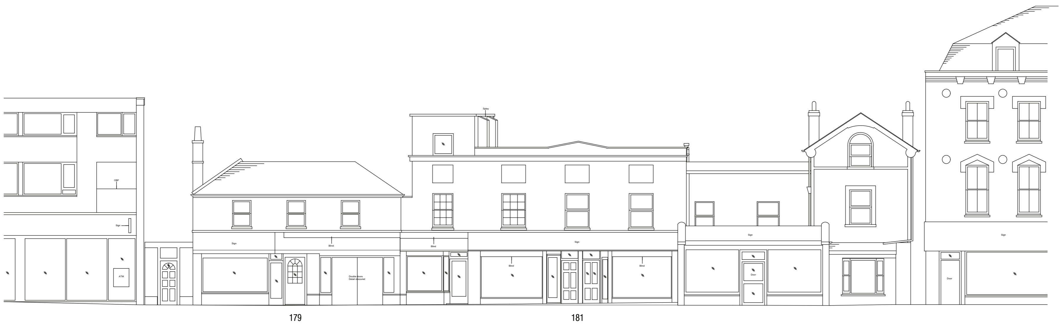
EXISTING HIGH STREET ELEVATION 1:100