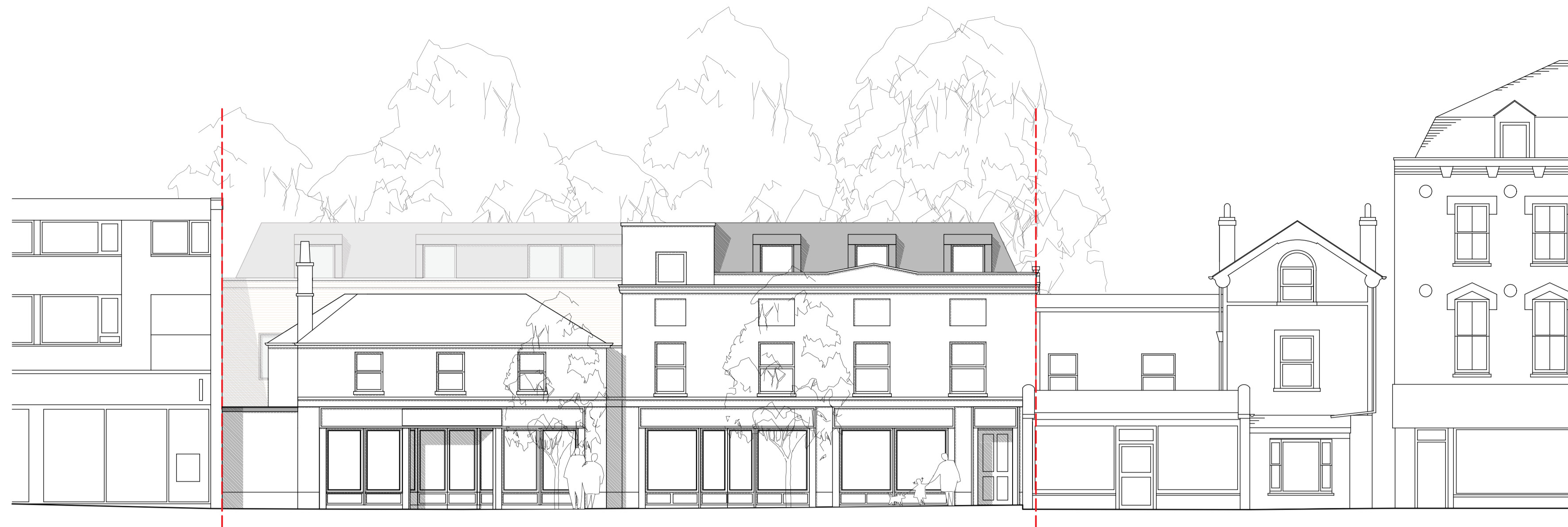
SOUTH EAST ELEVATION (HIGH STREET)

KEY BRICK TO MATCH EXISTING (YELLOW STOCK) SLATES TO MATCH EXISTING WITH LEAD DORMER CHEEKS WINDOWS: PAINTED TIMBER WINDOW FRAMES, REPLACEMENT DOUBLE GLAZED SASH WINDOWS WHERE NECESSARY