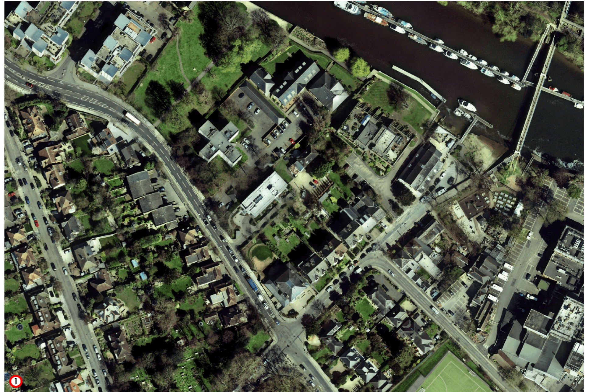
Photograph 1: Aerial photograph (Promap)

The site falls within the Teddington Lock Conservation Area (CA27) and sits within "Flood Zone 3" of the River Thames on the latest Environmental Agency maps.