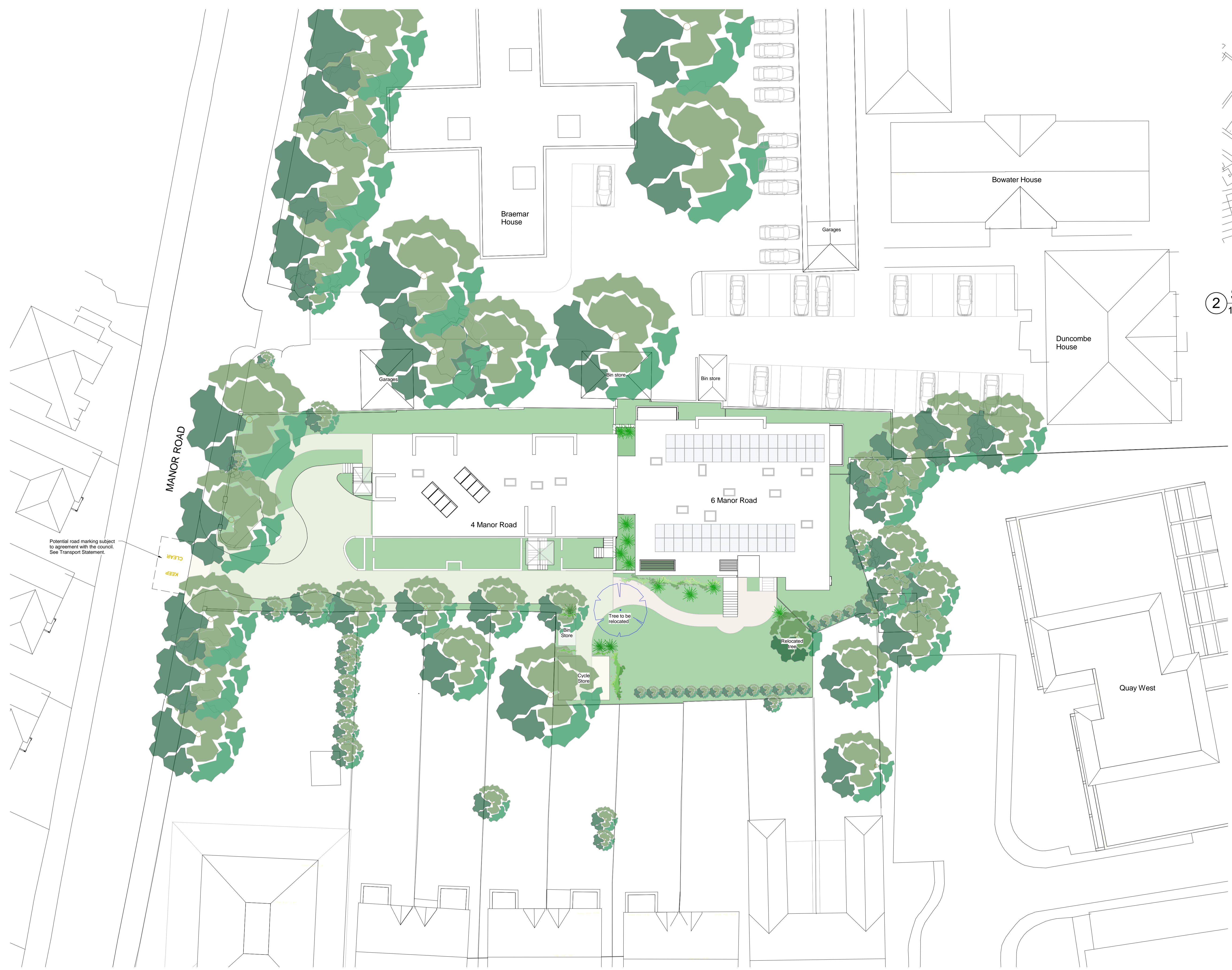
1 Roof and Context Plan 1 : 200

Potential road marking subject to agreement with the council. See Transport Statement.