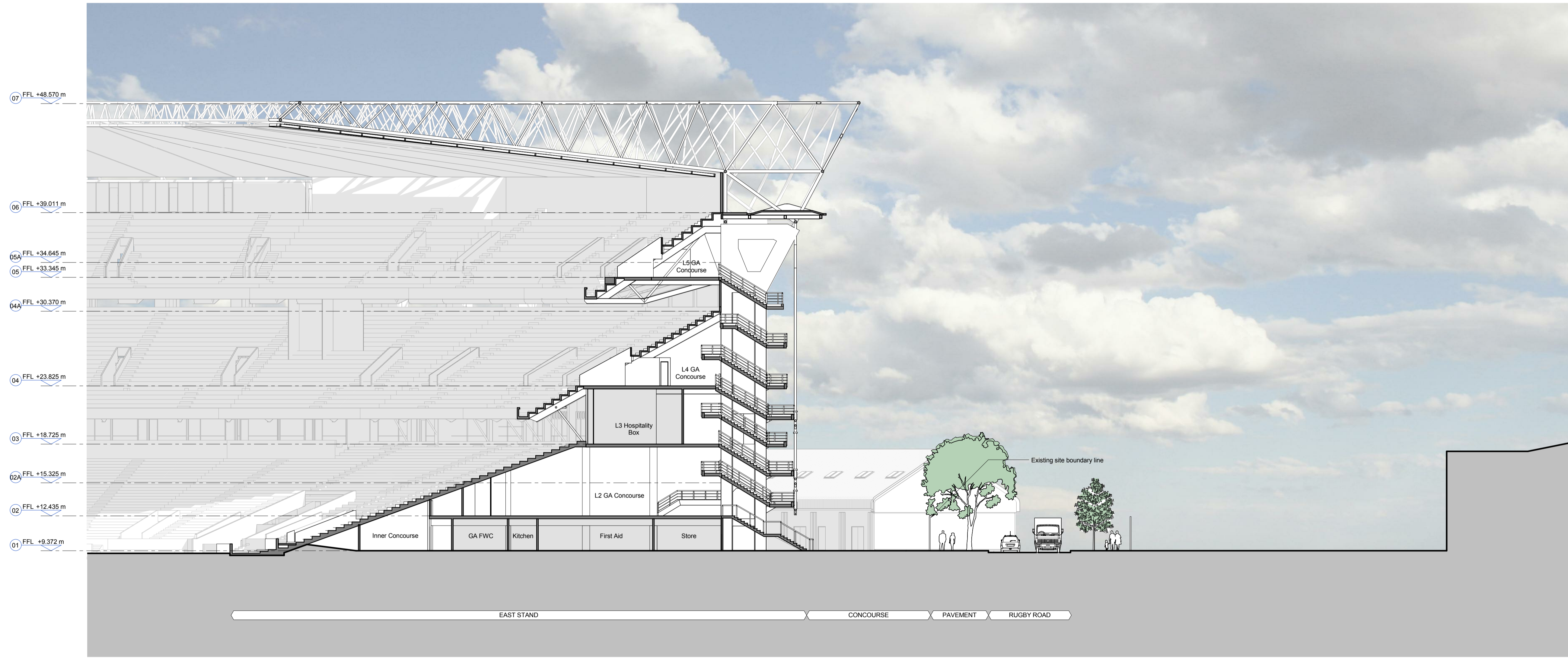
1 SECTION A SECTION EXISTING 1:200

NOTES To be read in conjunction with the following drawing series: 001,010,020,030,110,120,200,300,800.