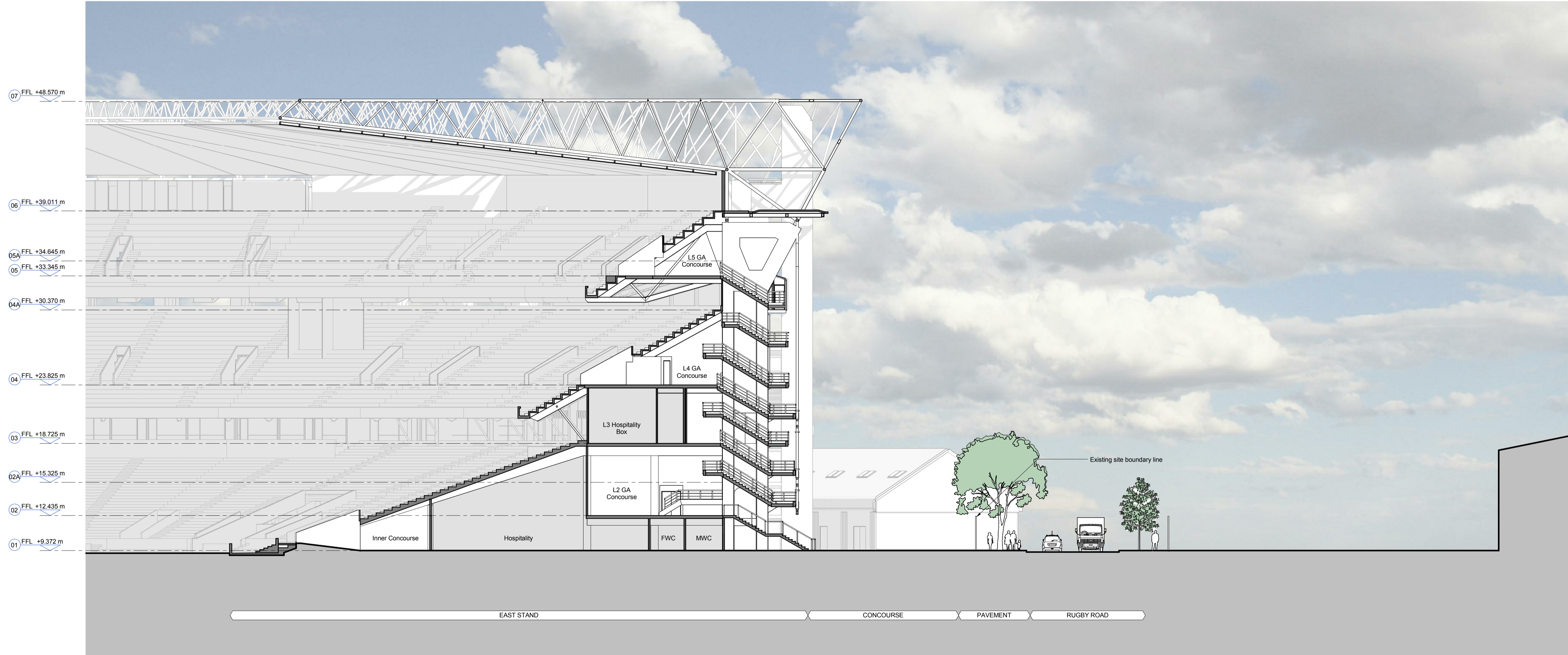
1 SECTION B SECTION EXISTING 1 : 200

NOTES To be read in conjunction with the following drawing series: 001,010,020,030,110,120,200,300,800.