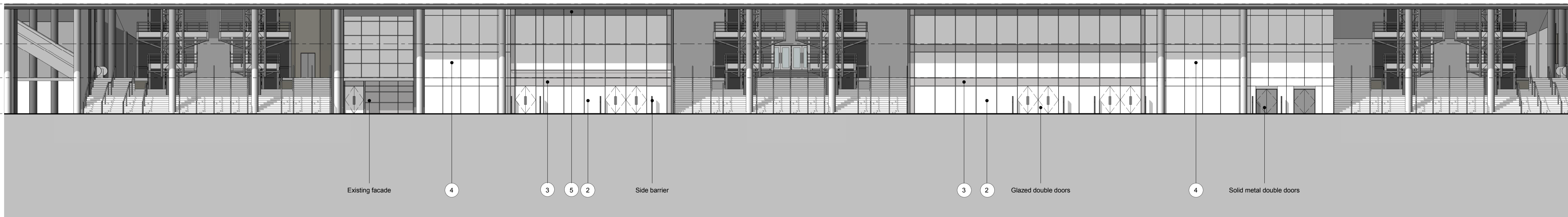
3 ELEVATION CONCOURSE NORTH EAST ELEVATION 1:200

+18.725 m FFL (03) +15.325 m FFL (02A) +12.435 m FFL (02) +9.372 m FFL (01)