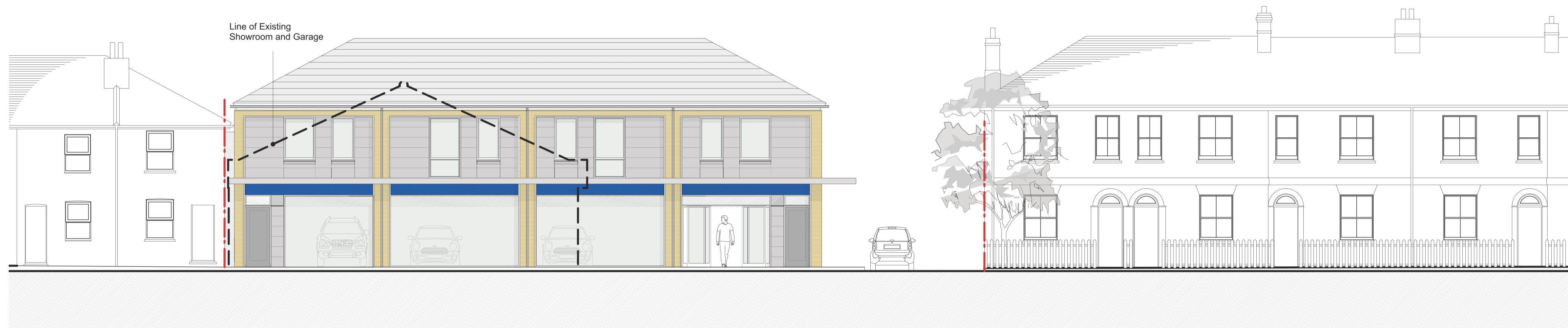
STATION ROAD STREET ELEVATION 1:100