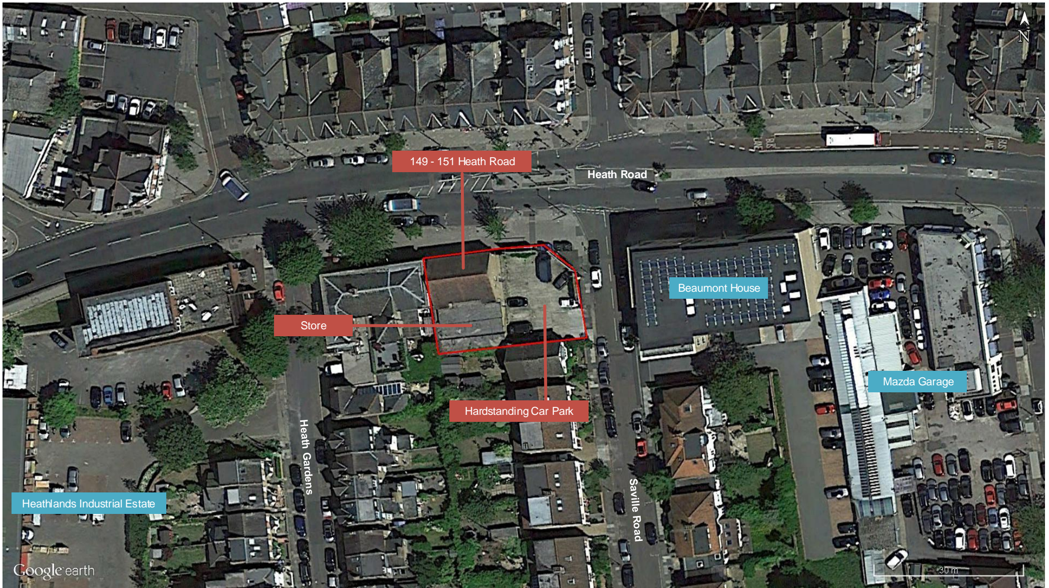
Google Earth Imaging with the permission of Google - Licensed to Earth and Marine Environmental Consultants Ltd