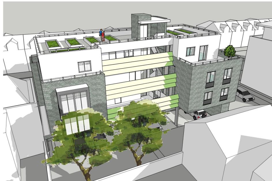
REAR ELEVATION BEFORE