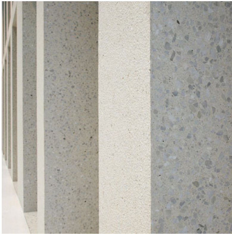
PALE FAIR-FACED CONCRETE COLUMNS