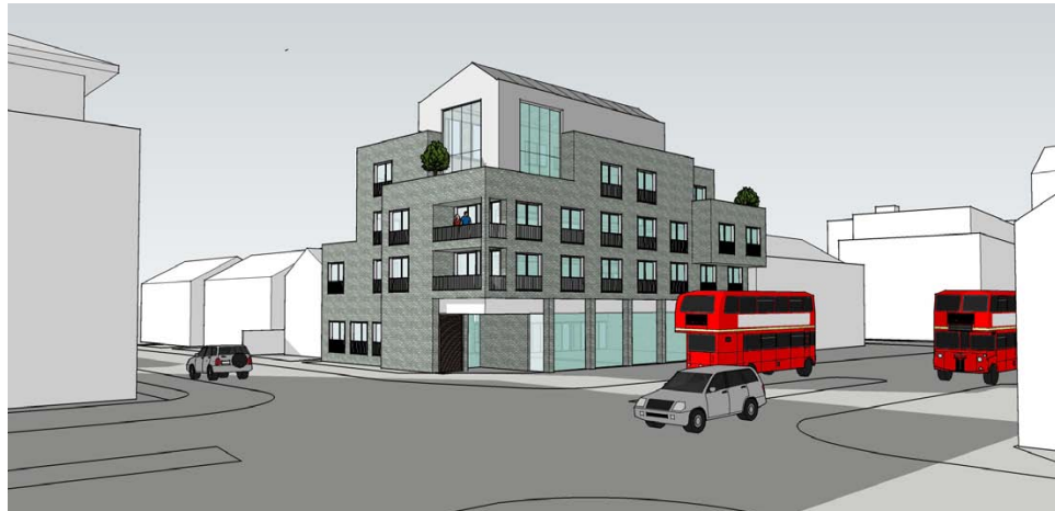
DESIGN SUBMITTED TO FIRST PRE-APPLICATION MEETING