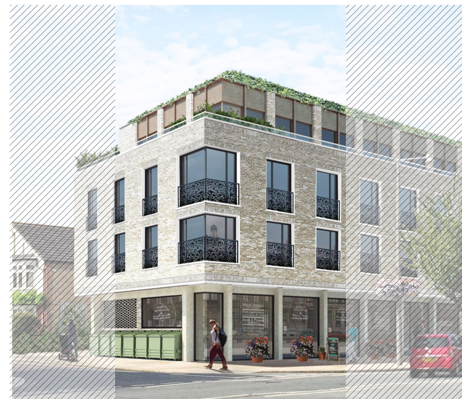
FRONT ELEVATION AFTER