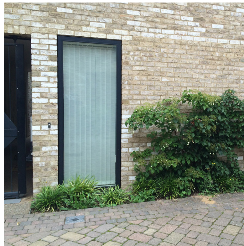
PAVING, PLANTERS & BRICKS AT ACCORDIA, CAMBRIDGE

Proportions have been carefully controlled in this design, with an interplay of horizontal and vertical features. Windows reflect the vertical (portrait) design typical of the street, and use two classic proportions, the upper windows follow the Golden Section, the lower windows use the less famous proportion of 1: 2 , which is actually much more common in classical architecture. The different proportions on different levels is known as 'Georgian proportions.' It can be seen that there are never more than seven identical windows on one façade, which is the cut-off point of countability and has been found to offer satisfying visual complexity.