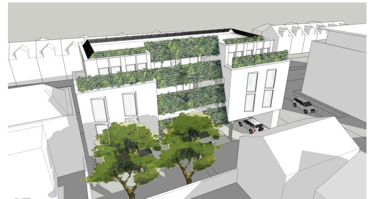
VIEW OF SOUTH ELEVATION - AERIAL VIEW