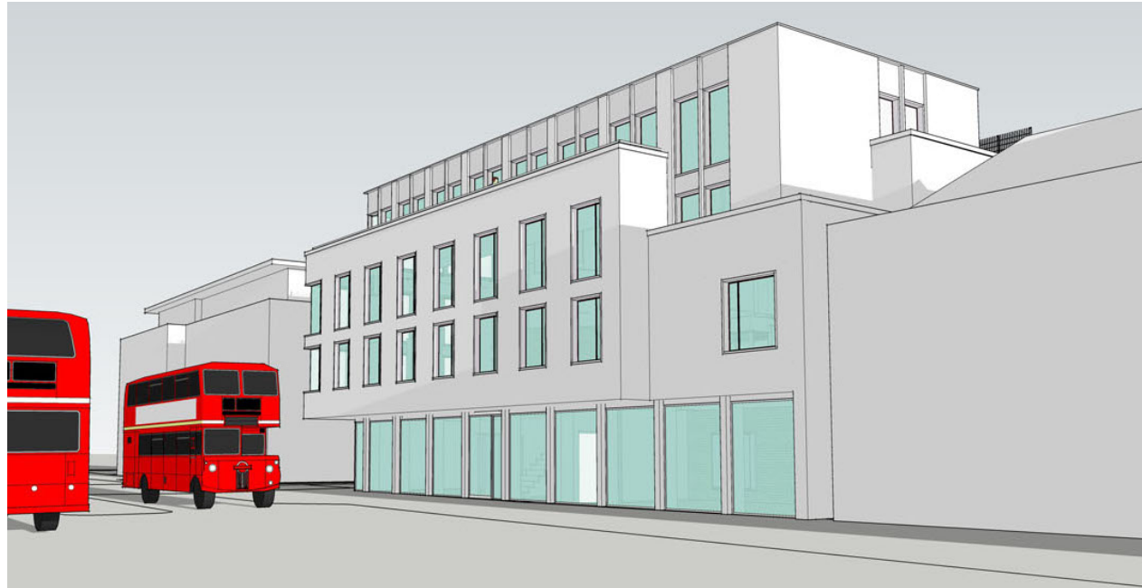
VIEW OF NORTH ELEVATION - LOOKING EAST

In the design development we see how the architects responded to the different scales appropriate to buildings on the main road and side road. The conclusion was that the site is too small to have two elements addressing different roads, the proposal takes its place in the line of medium-scale buildings along Heath Road, and is separated from the block behind by an open courtyard.