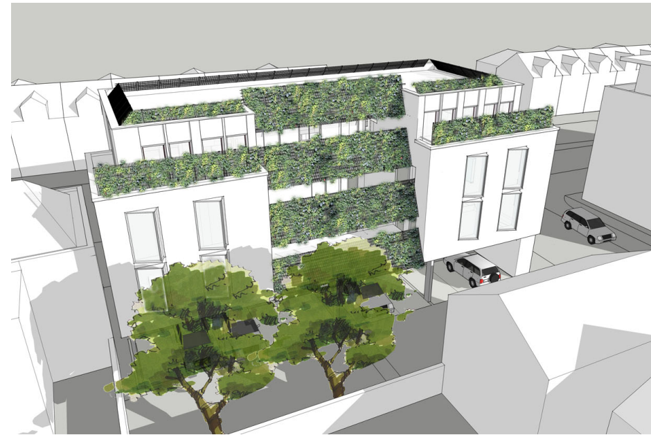
REAR ELEVATION AFTER