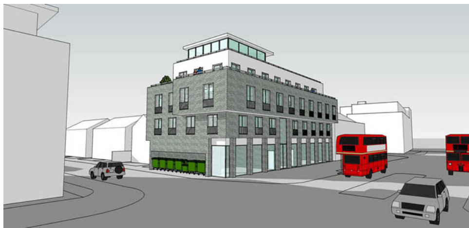
DESIGN SUBMITTED TO THIRD PRE-APPLICATION MEETING