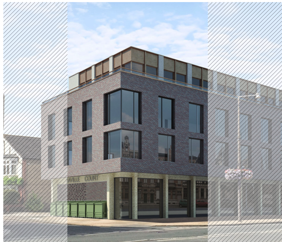
FRONT ELEVATION BEFORE