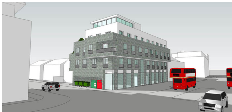
DESIGN SUBMITTED TO SECOND PRE-APPLICATION MEETING