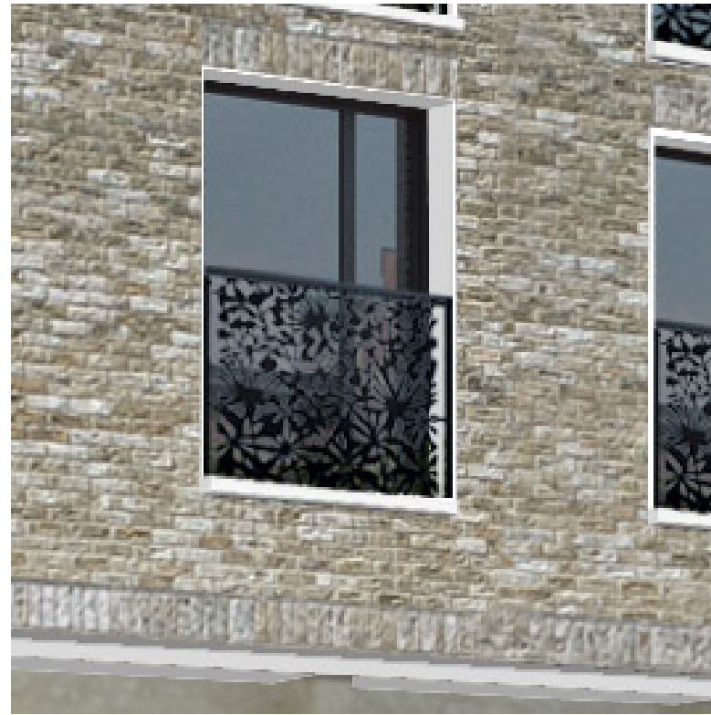
PROPOSED DETAILING - COMPUTER GENERATED IMAGE