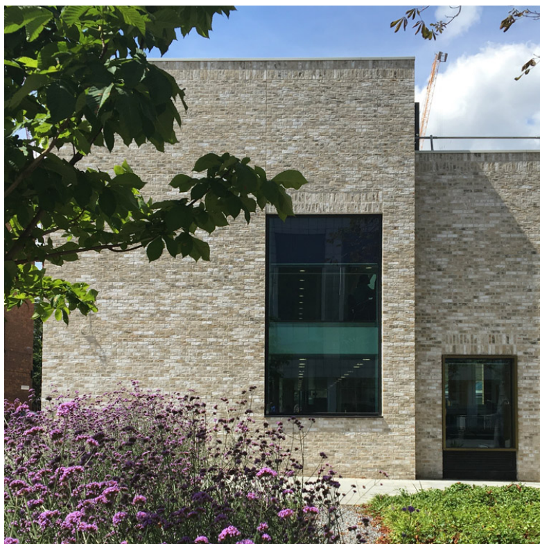
BRICKS & SOLDIER COURSES AT CAMBERWELL LIBRARY