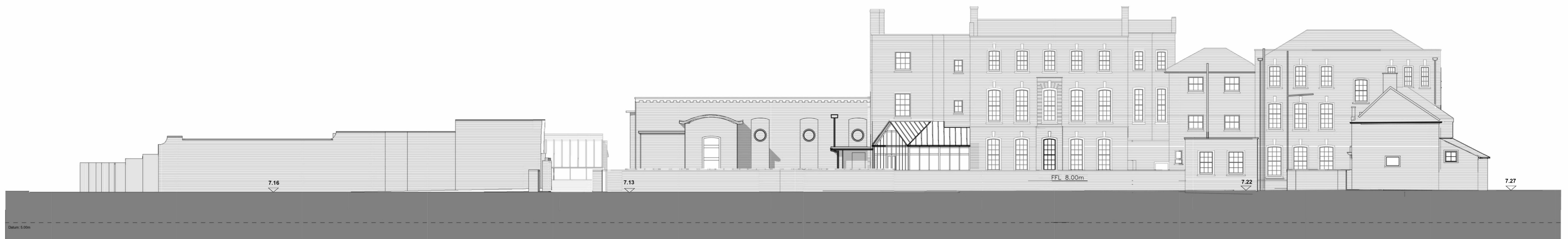
Existing South Elevation 1 : 100