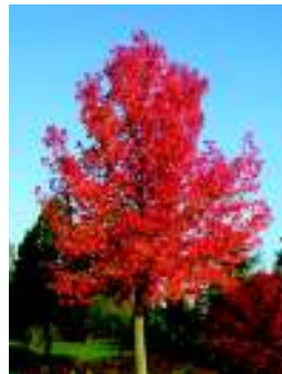
● Liquidamber styraciflua 20-25cm girth