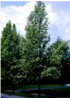
● Pyrus calleryana 'Chantelier' 25-30cm girth