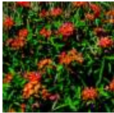
Euphorbia griffithii 'Fireglow'