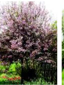
● Prunus padus 18-20cm girth