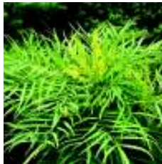
Mahonia 'Soft Caress'