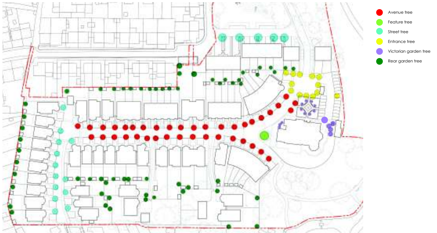
Enclosures Strategy Diagram, N.T.S.