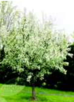
● Malus 'John Downie' 18-20cm girth