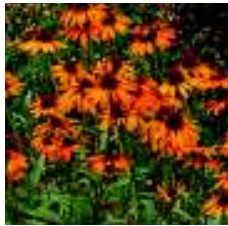
Echinacea 'Tiki Torch'