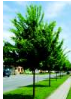
● Acer campestre 'Elsrijk' 20-25cm girth