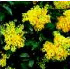
Mahonia aquifolium 'Apollo'