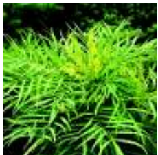
Mahonia 'Soft Caress'