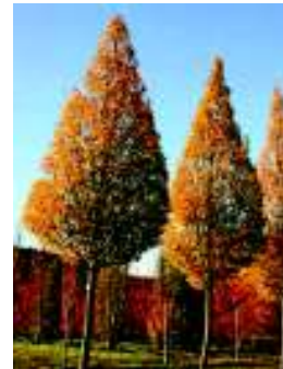
● Carpinus betulus 'Frans Fontaine' 20-25cm girth