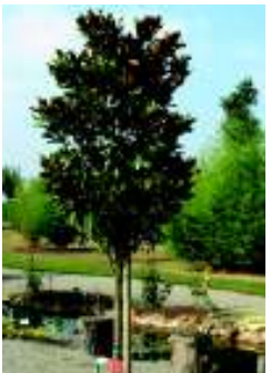
● Magnolia grandiflora Praecox, 20-25cm girth