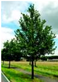
● Quercus robur , 30-35cm