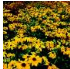
Rudbeckia hirta 'Indian Summer'