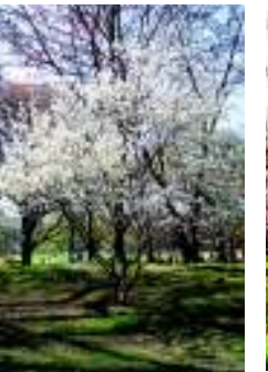
● Amelanchier lamerckii 18-20cm girth