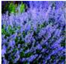
Nepeta 'Six Hills Giant'