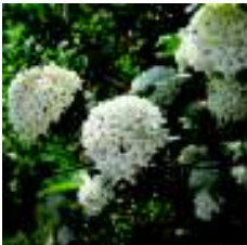
Viburnum x burkwoodii