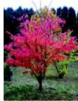
● Malus 'Tschonoskii' 18-20cm girth