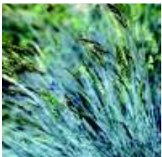
Festuca glauca 'Elijah Blue'