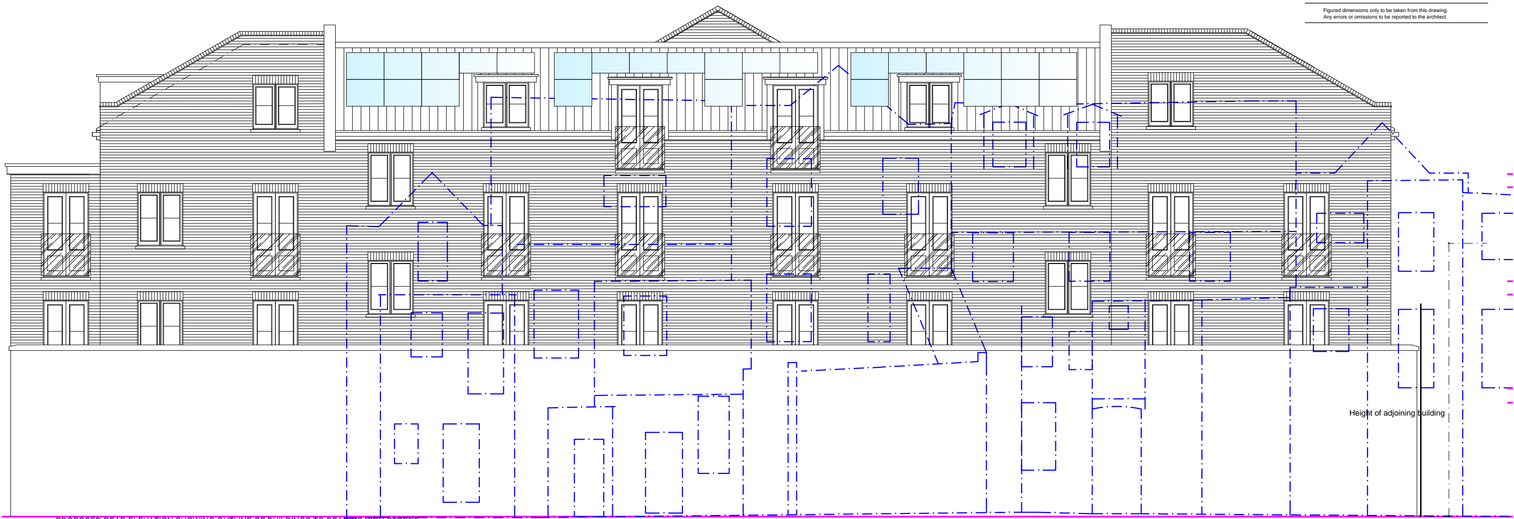
PROPOSED REAR ELEVATION SHOWING OUTLINE OF BUILDINGS TO REAR OF HIGH STREET