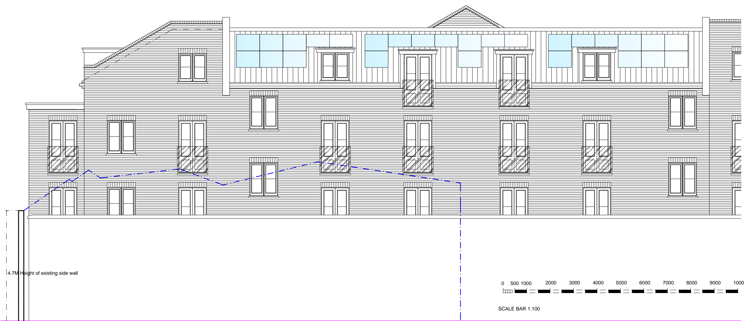
4.7M Height of existing side wall