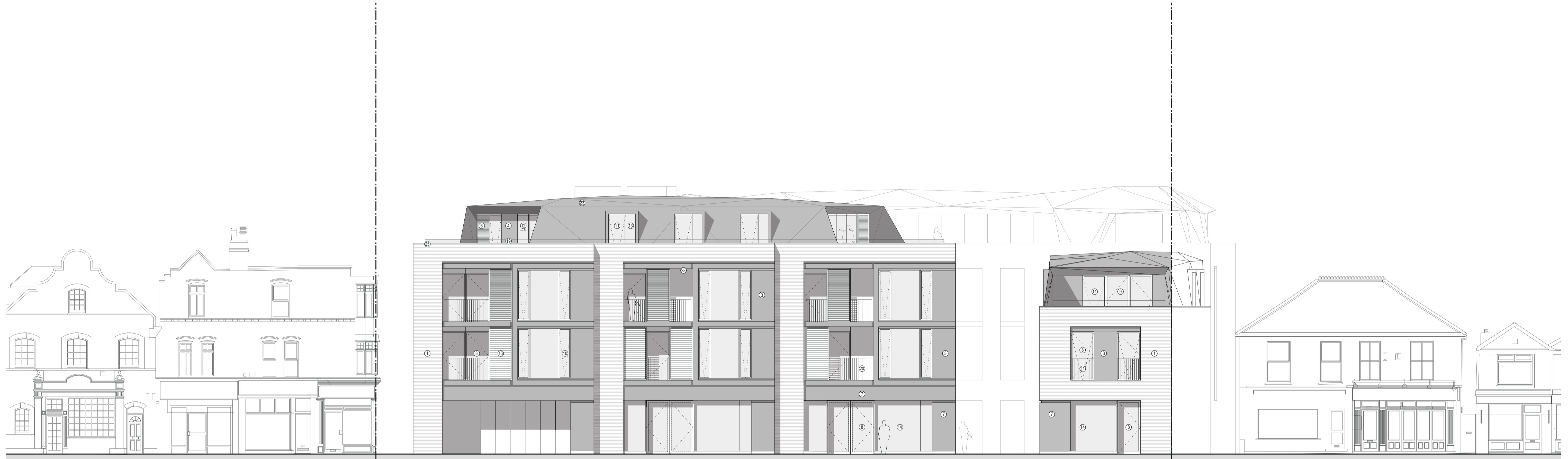
PROPOSED ELEVATION A - HIGH STREET EAST ELEVATION